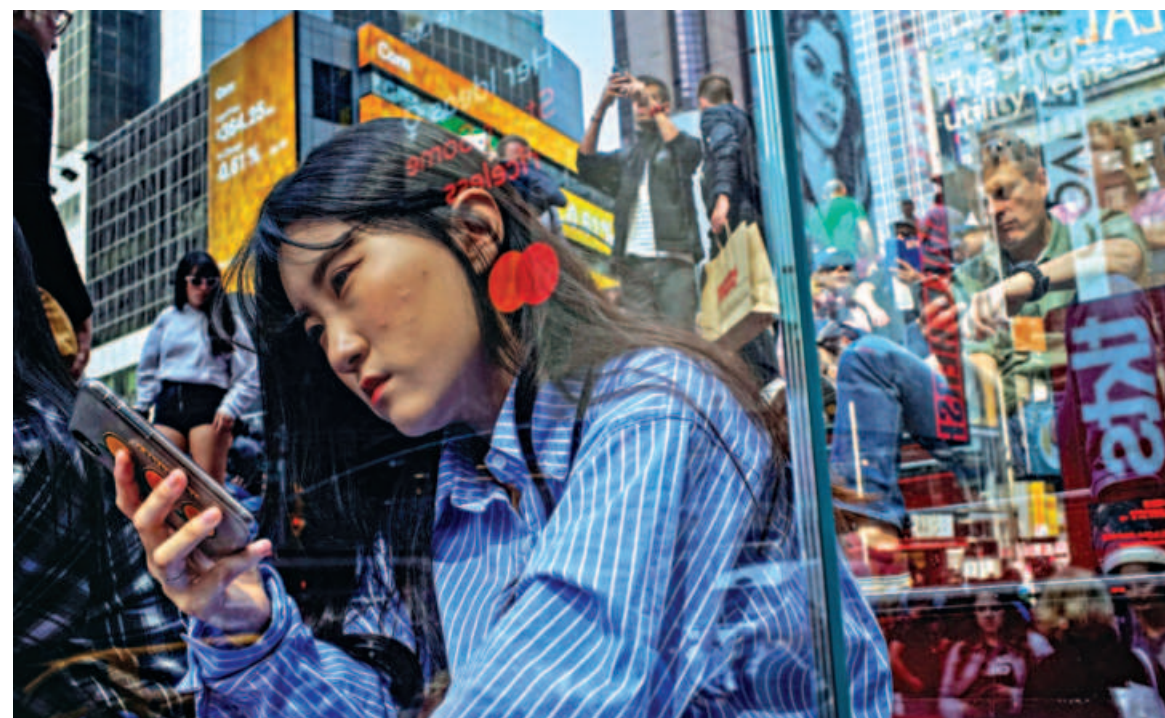
People look at their smartphones in Times Square in New York City, US.