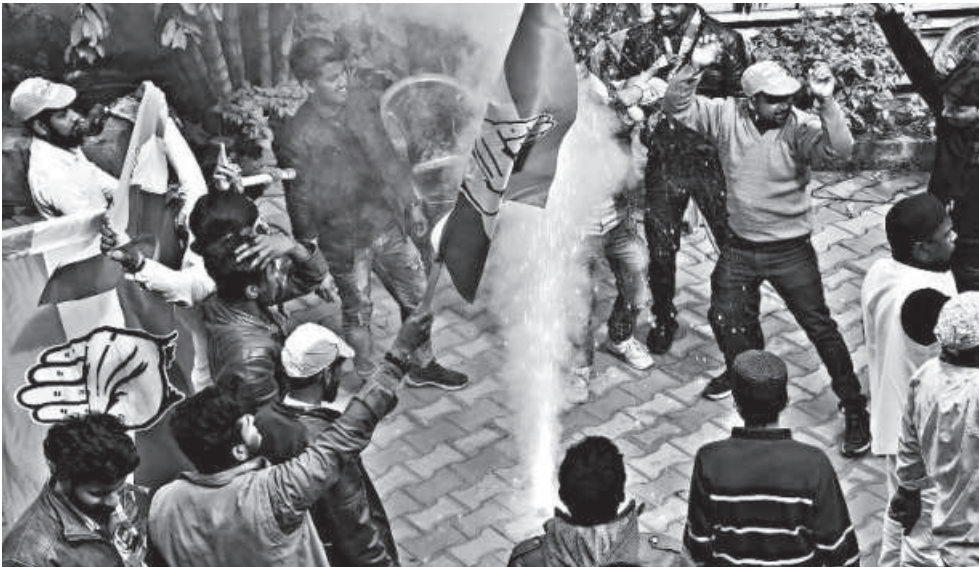
Congress-JMM-RJD alliance supporters celebrate in Ranchi, the capital of the Indian state of Jharkhand, after the results of the recent assembly polls were declared.

provided by the party’s government under non-tribal Chief Minister Raghubar Das—which survived a full five-year term in a predominantly tribal state that had earned the notoriety of chief ministers changing quicker than seasons due to the quicksand of shifting political loyalty—did not cut ice with the electorate. Secondly, playing up the polarising narrative to cover up anti-incumbency and governance deficit may have run its course and is less likely to find traction among voters over a time. The results of Maharashtra, Haryana and Jharkhand assembly elections are likely to reinforce the view among anti-BJP forces that bread-and-butter issues can actually neutralise the impact of polarising planks, and that the BJP may not have succeeded in delinking politics from economics, as suggested by some analysts.