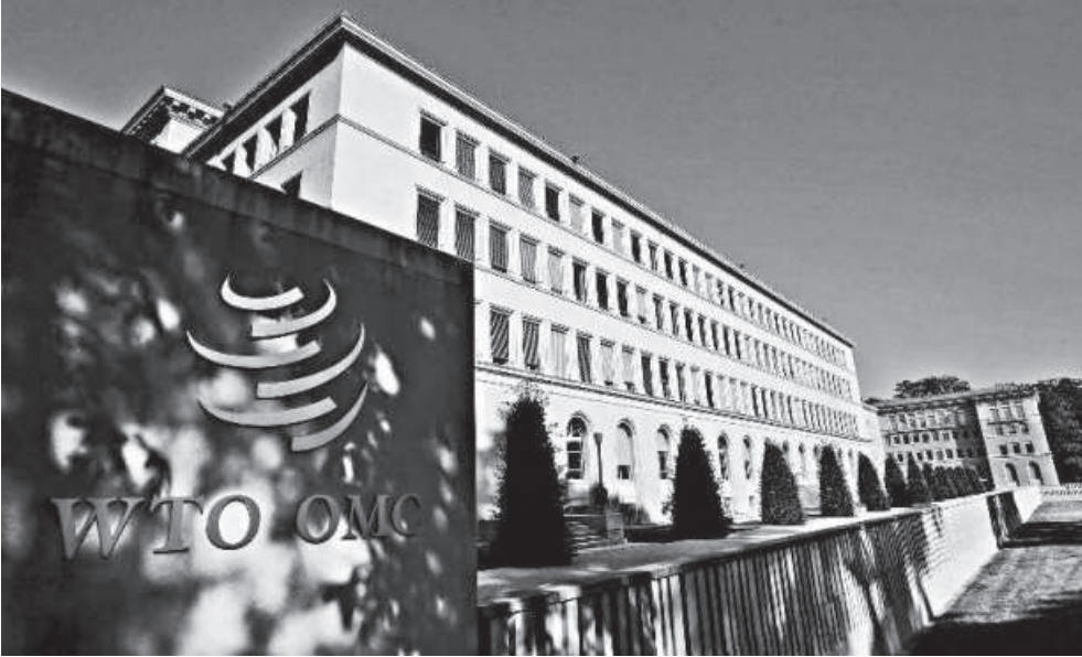
The World Trade Organization (WTO) headquarters in Geneva, Switzerland.

towards the US. US Senator Pat Toomey, a Republican, said that USMCA “is the only trade pact ever meant to diminish trade”, and labelled it “protectionist”. He was aghast that the US will pay Mexico up to USD 45 million a year to enforce Mexican labour laws, under the penalty of raised tariffs and embargoes. “I still believe that free trade is far better for my constituents than restrictive, managed trade, and hope USMCA’s protectionism doesn’t become the template for future trade agreements,” Toomey added. The details of the Phase I agreement with China still remain under wraps. There is uncertainty about the actual provisions and the possible impact on individual products. The US cancelled a planned increase of tariffs on USD 156 billion of goods that it imports annually from China including smart phones,