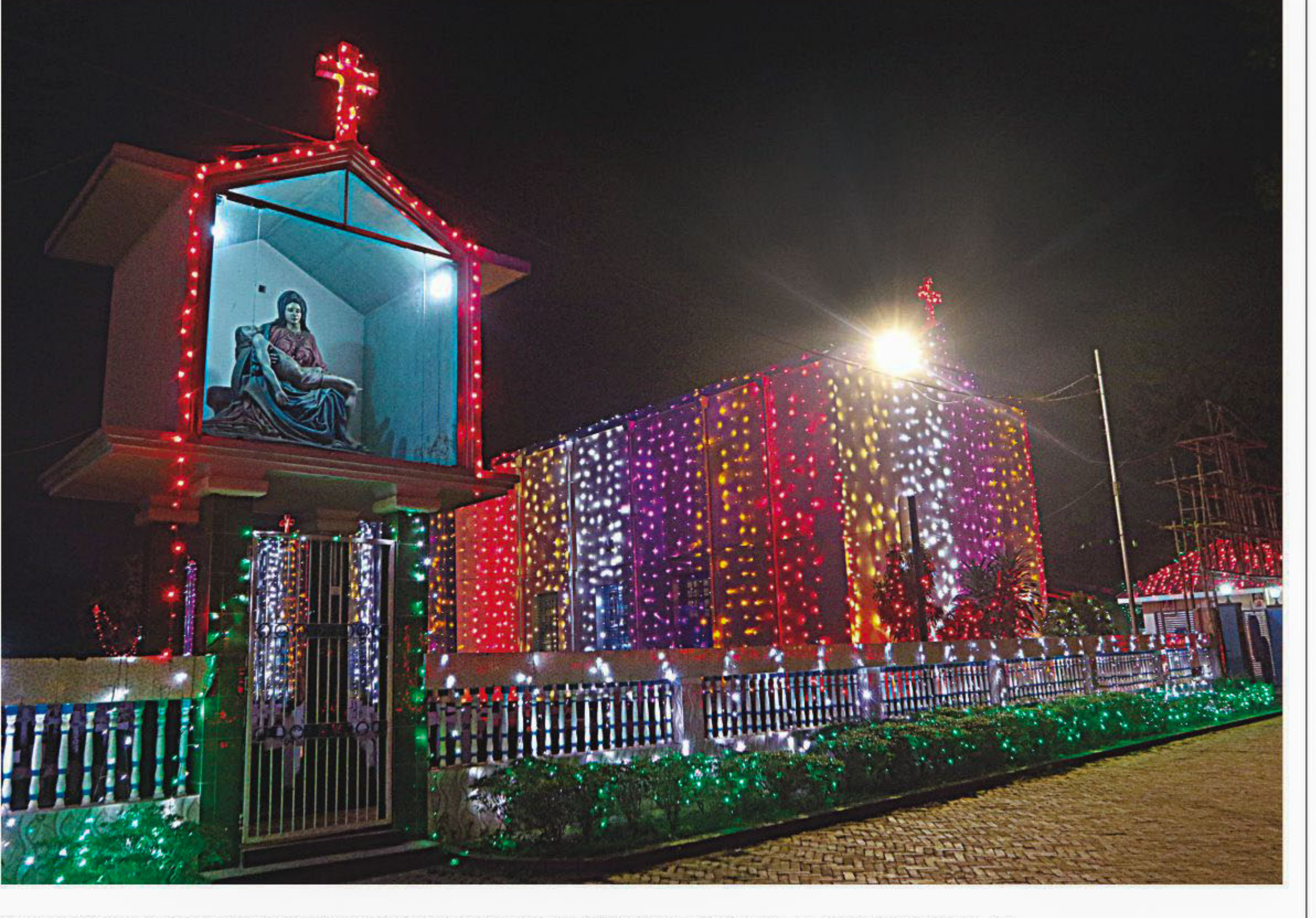
A church in the capital's Tejgaon is decorated with lights ahead of Christmas. Christians all over the world are set to celebrate their biggest religious festival tomorrow commemorating the birth of Jesus Christ.

We request all relatives, friends and well-wishers to remember her in their prayers and to pray for eternal peace of her soul