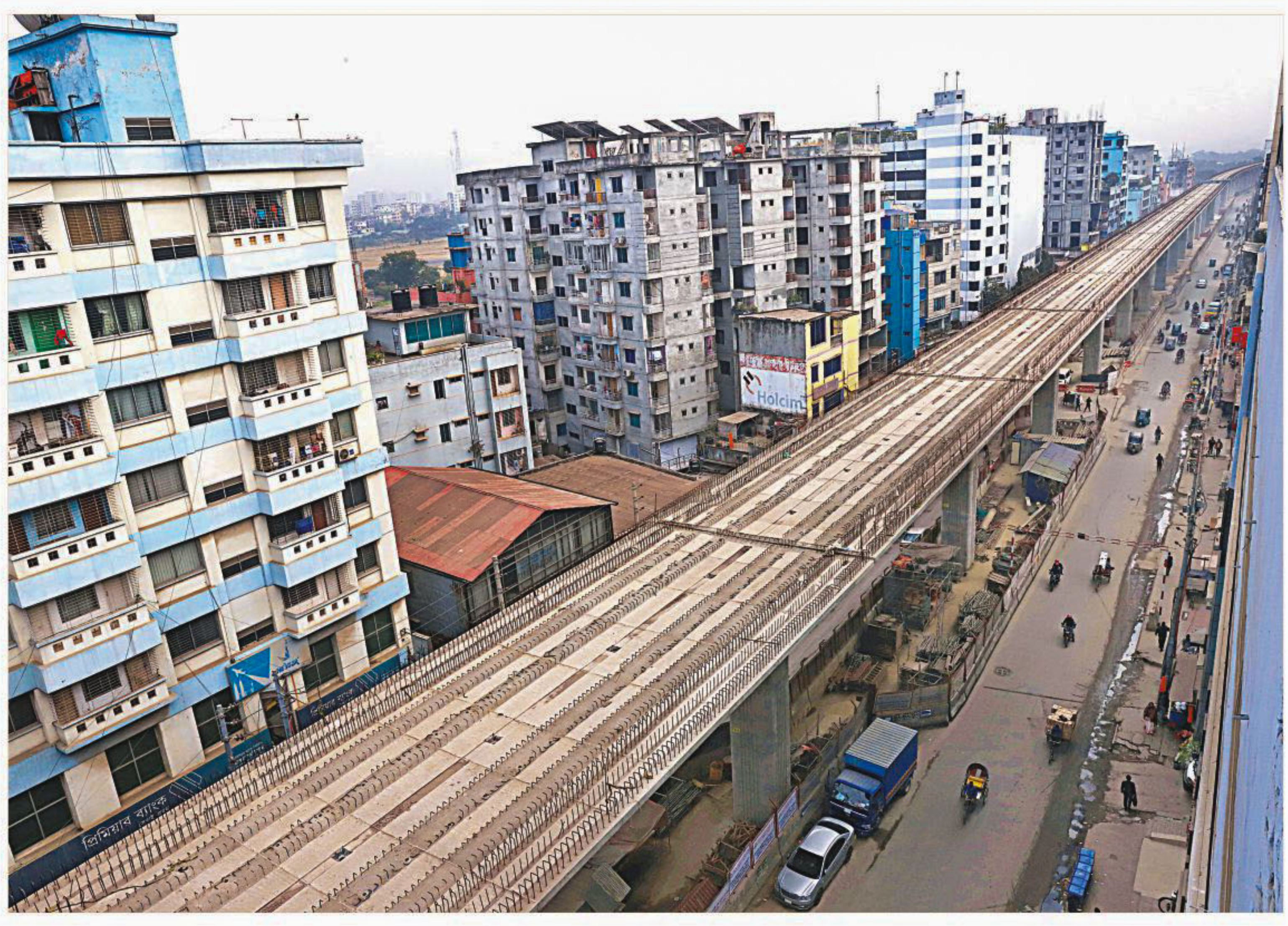
A portion of the metro rail's viaduct in Shewrapara in the capital. The project authorities are set to start installing rail lines on the elevated structure on January 1. The photo was taken yesterday.