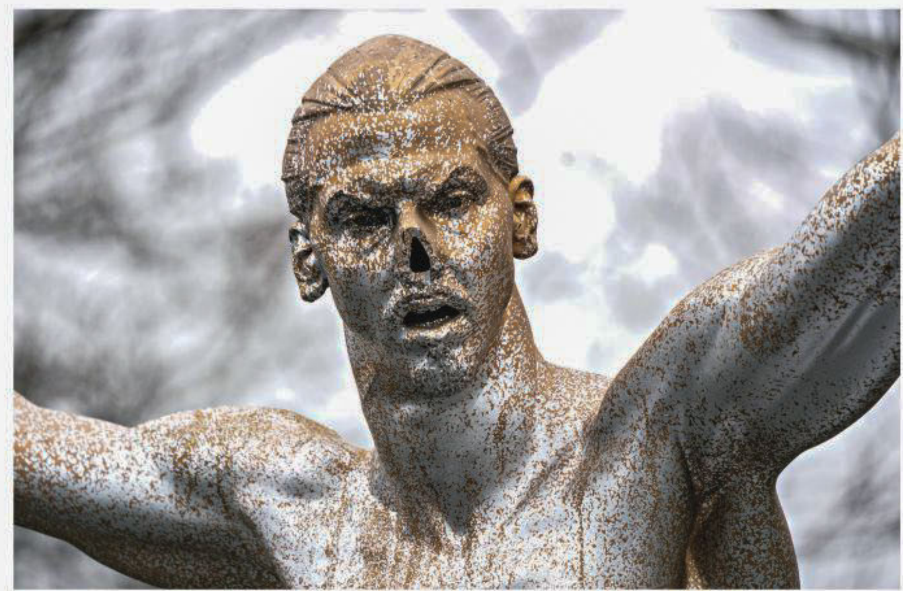
Vandals defaced the Zlatan Ibrahimovic statue in Malmo quite literally yesterday as it was found with its nose cut off.