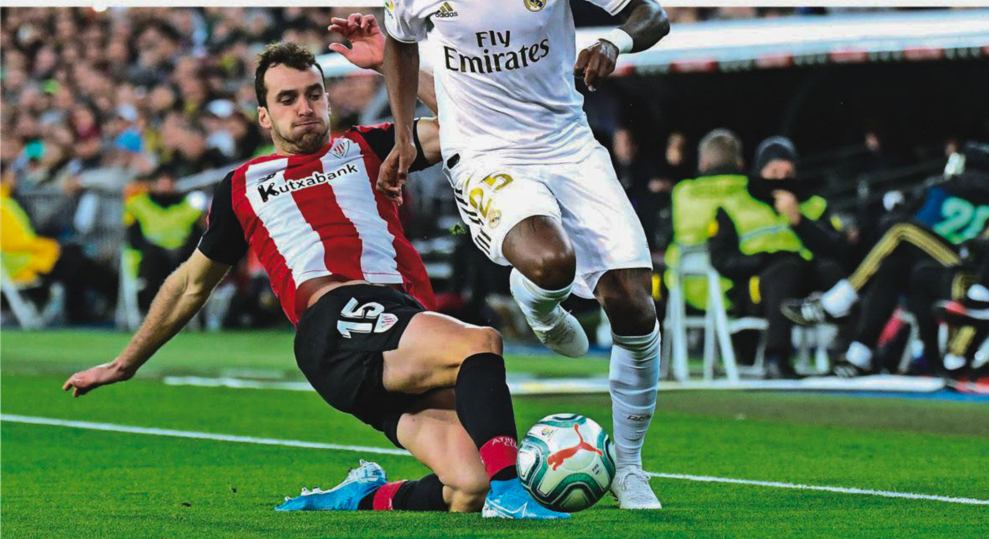
Athletic Bilbao defender Inigo Lekue (L) challenges Real Madrid forward Vinicius Junior in a La Liga encounter at the Santiago Bernabeu in Madrid on Sunday. The match ended in a 0-0 draw.