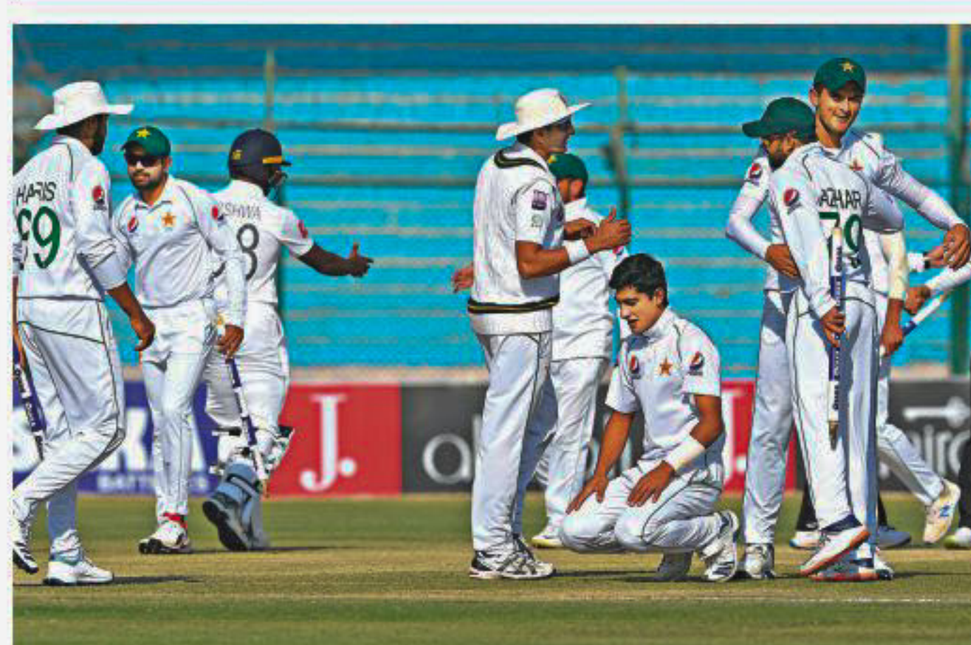
Pakistan's 16-year-old pacer Naseem Shah celebrates after delivering a historic win and also becoming the second-youngest player to take a fiver on the fifth morning of the second Test against Sri Lanka at the National Stadium in Karachi yesterday.