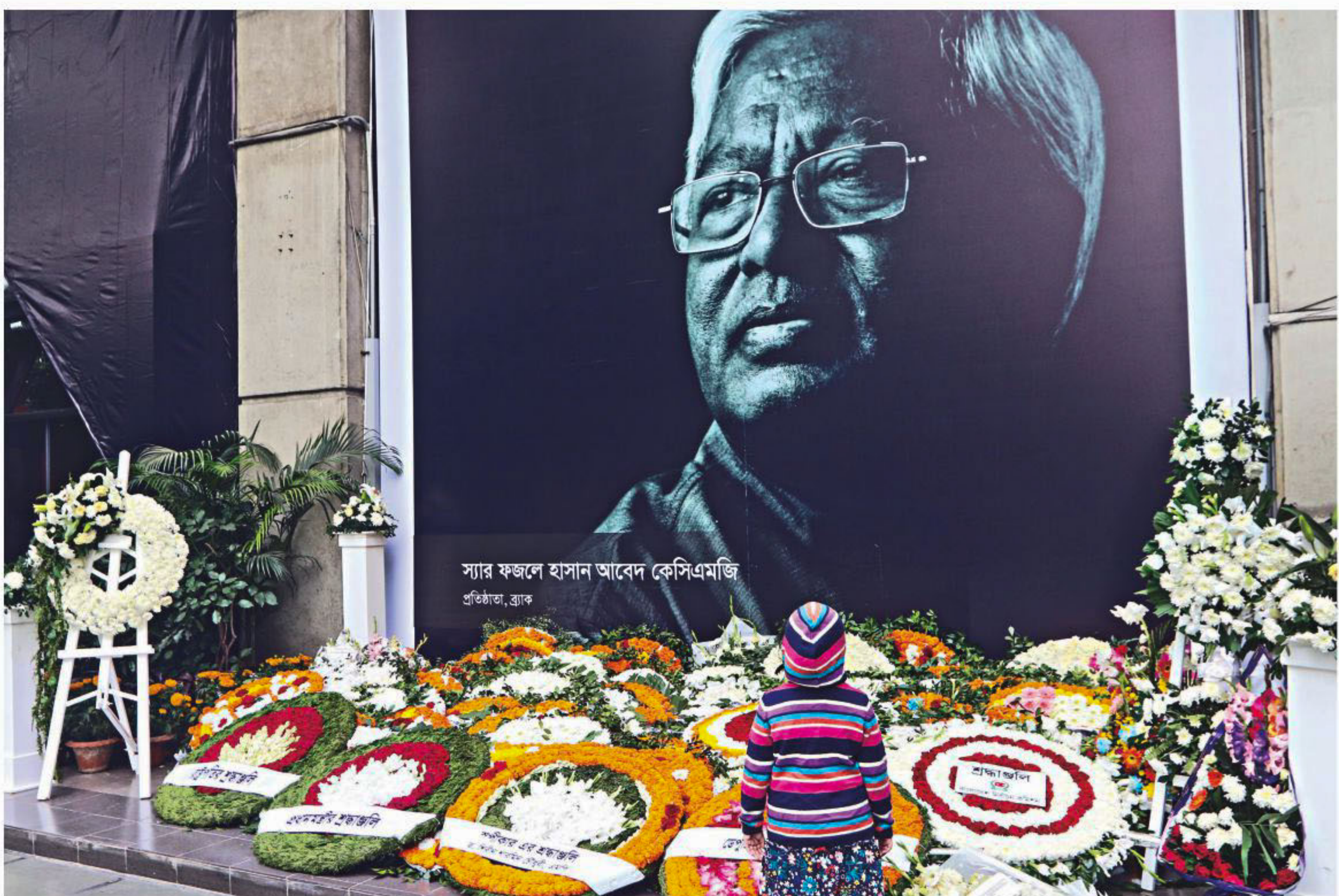
A child looks up at a picture of Sir Fazle Hasan Abed as wreaths are stacked up at a memorial space. This photo was taken yesterday in front of Brac Centre in Mohakhali.