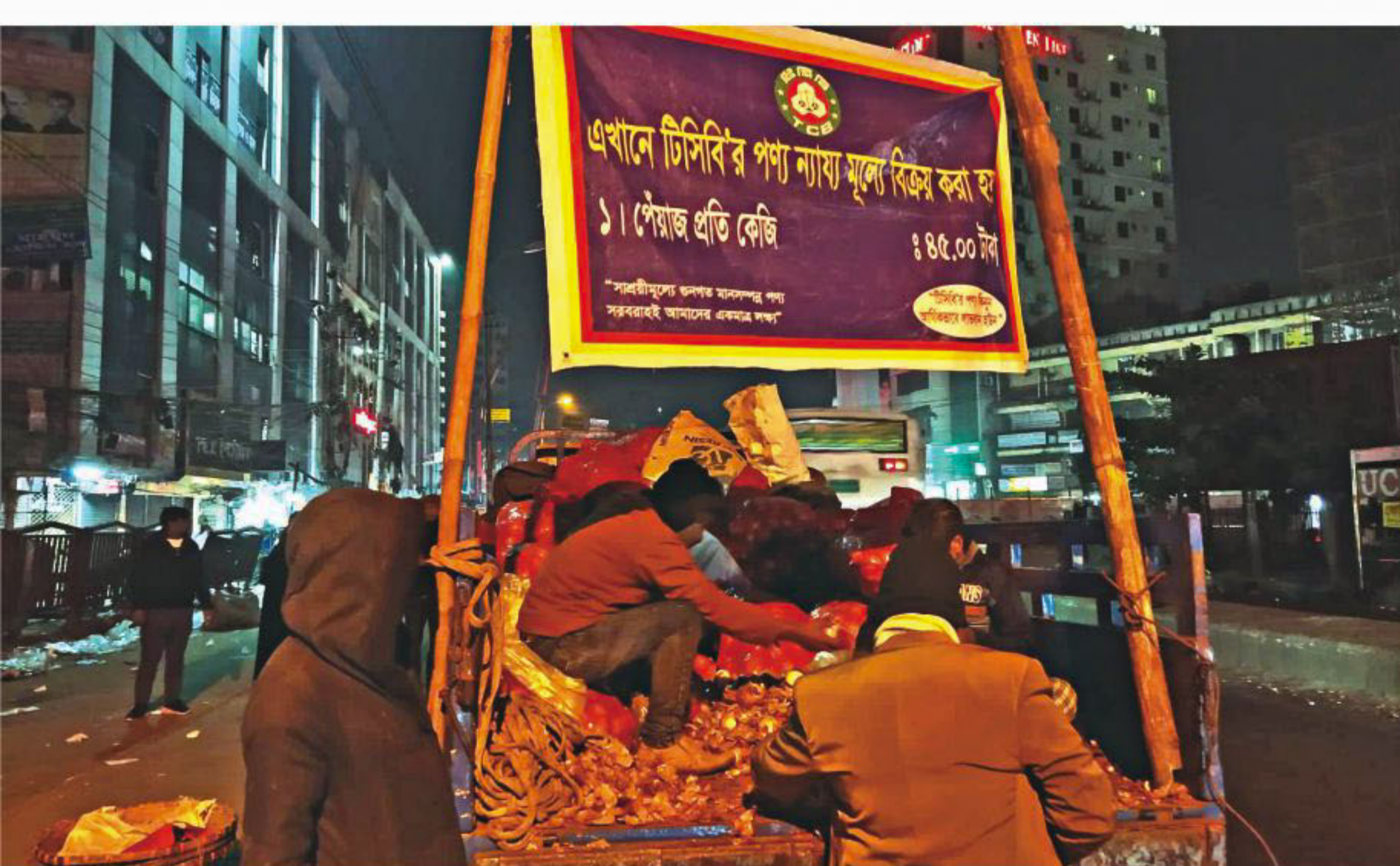
ONIONS AFTER HOURS... A truck of Trading Corporation of Bangladesh (TCB) was seen selling onions in Farmgate around 1am yesterday. The dealer said his designated selling spot was in the Secretariat area, but with the demand for imported onions dropping fast in the last few days, they have been unable to sell their daily allotment of three tonnes. They came to Farmgate around midnight yesterday -- as other vegetable sellers also sit there in the late hours -- to sell off the remaining stock at Tk 45 per kg, as the prices of onion at TCB trucks dropped to Tk 35 from yesterday.