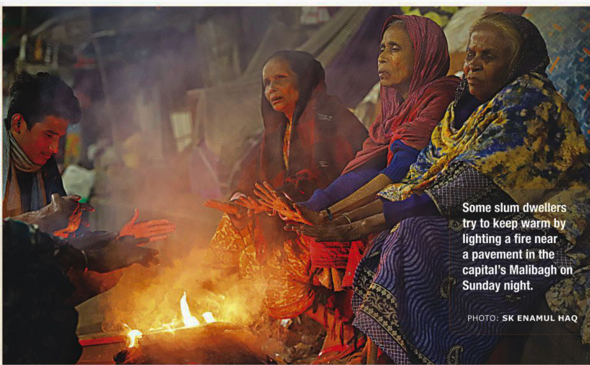
Some slum dwellers try to keep warm by lighting a fire near a pavement in the capital's Malibagh on Sunday night.