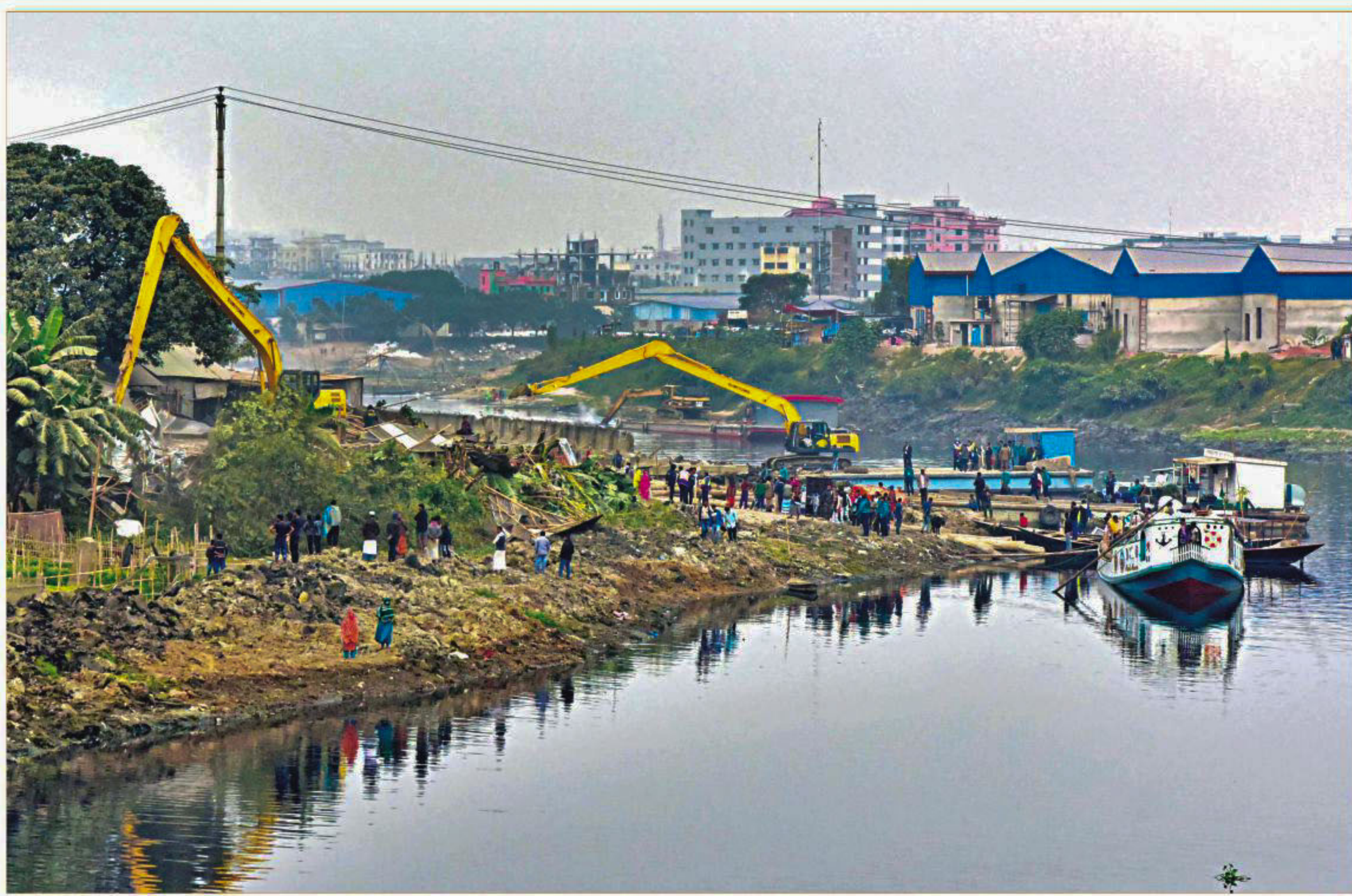
Excavators knock down illegal structures built on grabbed part of the Turag river near Kamarpara Bridge in Gazipur's Tongi. During a daylong drive, the Bangladesh Inland Water Transport Authority (BIWTA) demolished over 100 such structures in the area yesterday. More on page 13.