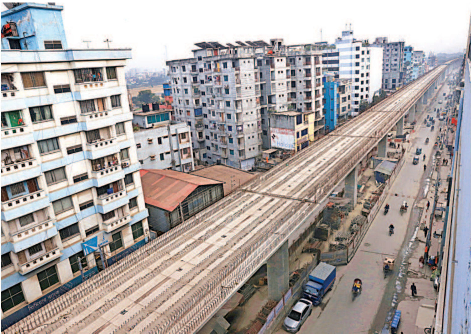
A portion of the metro rail's viaduct in Shewrapara in the capital. The project authorities are set to start installing rail lines on the elevated structure on January 1. The photo was taken yesterday.