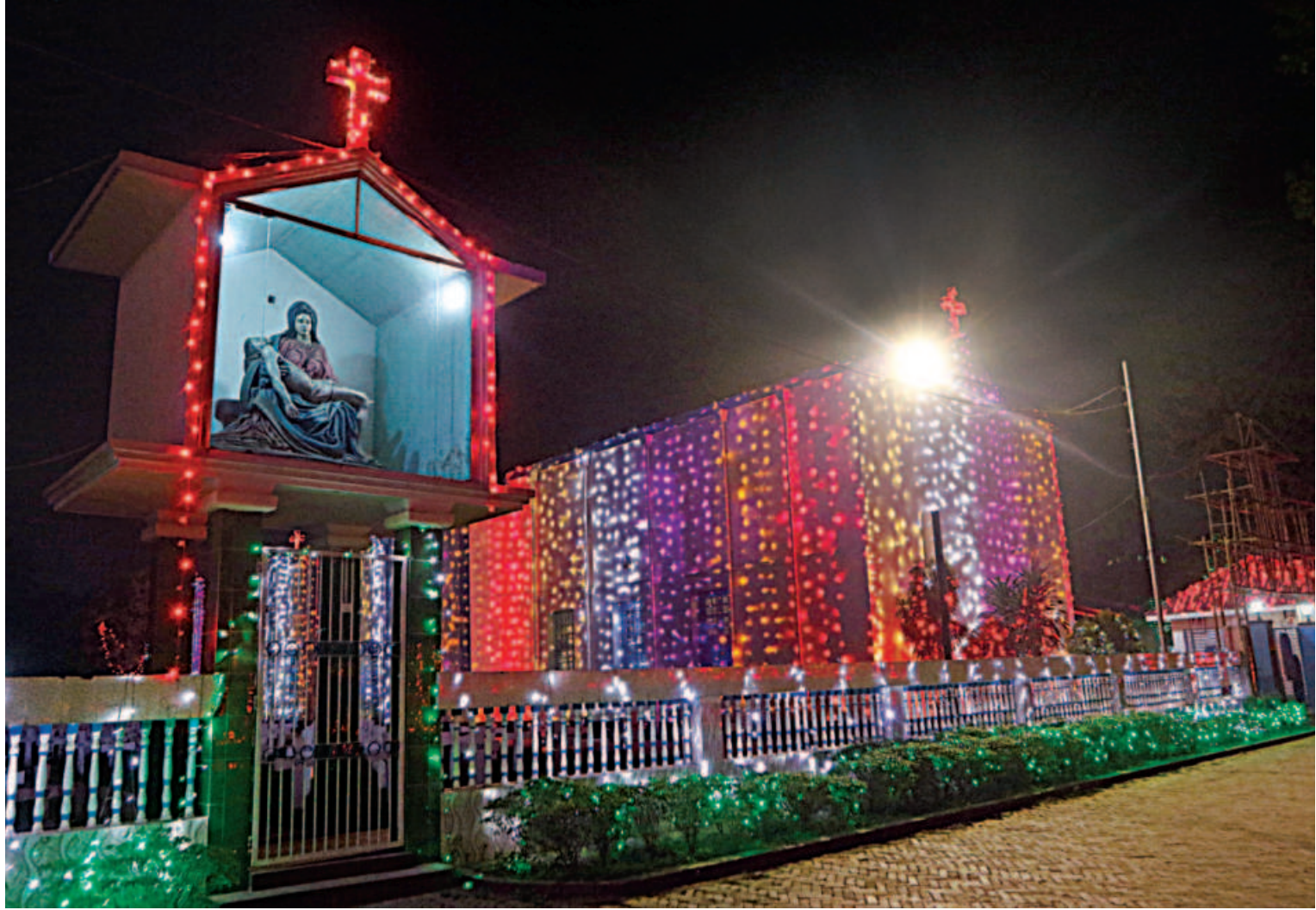
A church in the capital's Tejgaon is decorated with lights ahead of Christmas. Christians all over the world are set to celebrate their biggest religious festival tomorrow commemorating the birth of Jesus Christ.

People from religious minorities may have gone to India "due to persecution" after the BNP-led four-party alliance came to power in 2001, said Road Transport and Bridges Minister Obaidul Quader yesterday. "We will take them back if they want to return," Quader, also the general secretary of the ruling Awami League, said replying to a question at a press briefing on contemporary issues at his secretariat SEE PAGE 10 COL 5