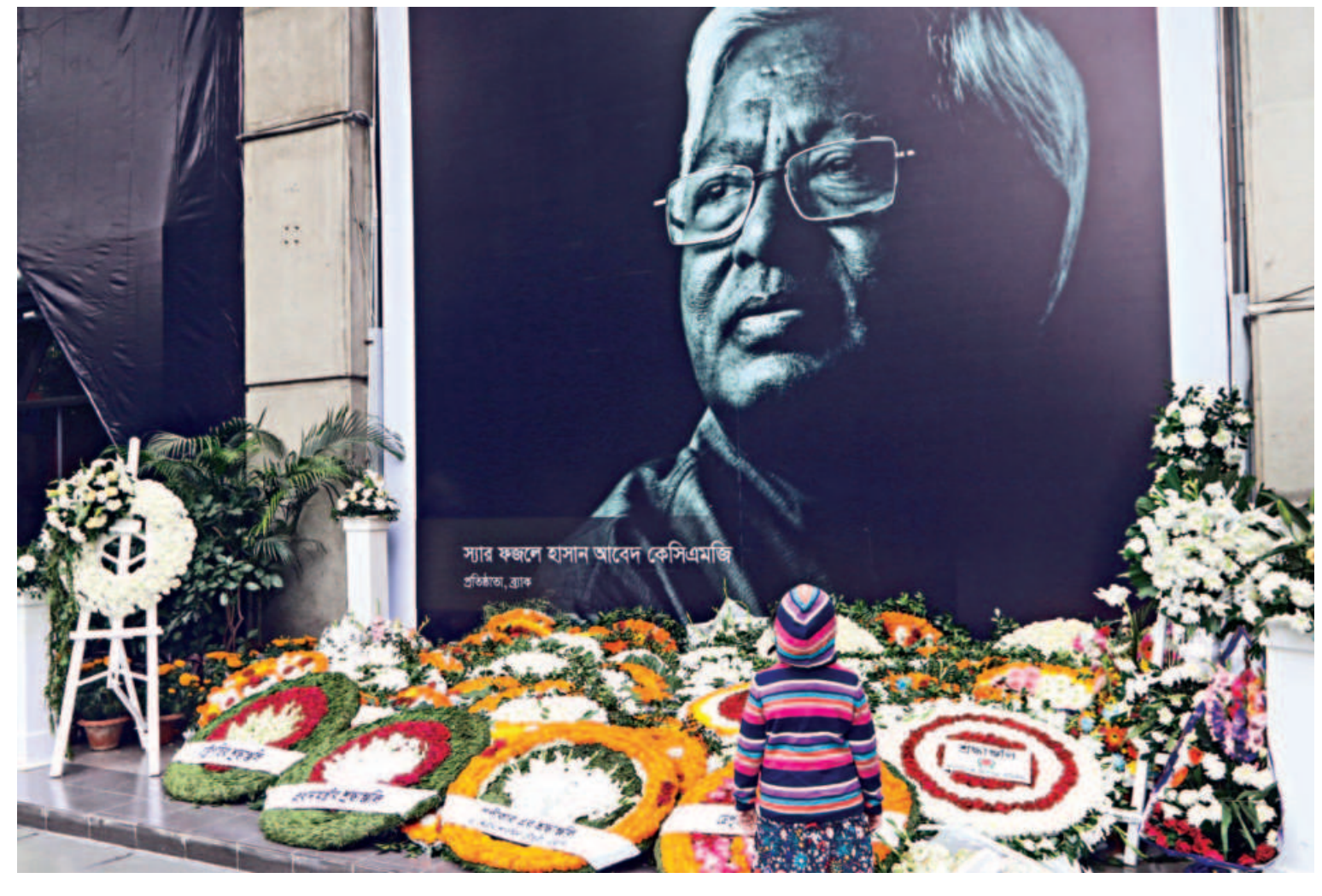
A child looks up at a picture of Sir Fazle Hasan Abed as wreaths are stacked up at a memorial space. This photo was taken yesterday in front of Brac Centre in Mohakhali.