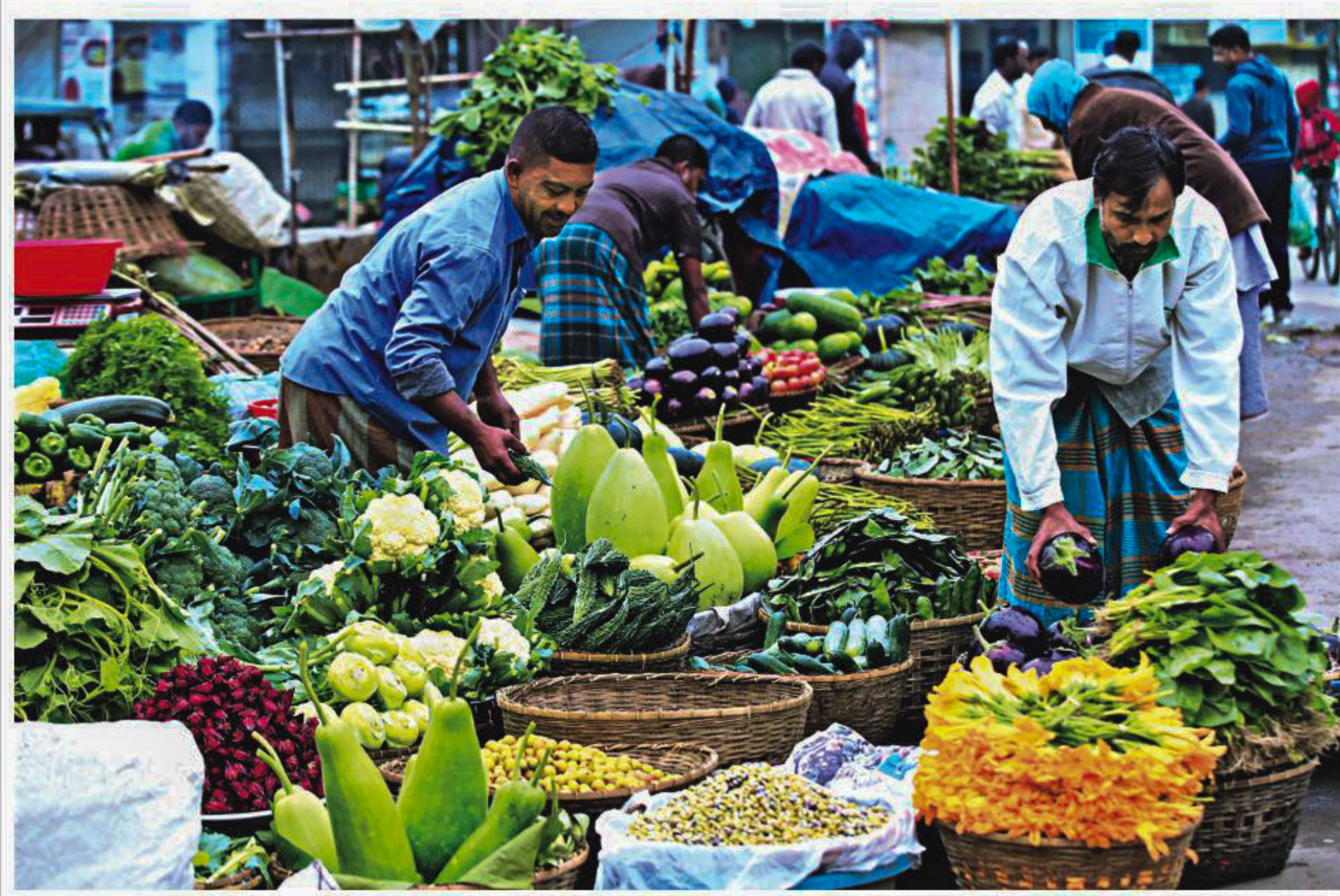
Winter is the season of vegetables. Like elsewhere, varieties of green goodness have started appearing in markets in Sylhet. Locals say despite adequate supply, the price is too high. This photo of vendors arranging vegetables was taken at the city's Rikabibazar market yesterday, where a kg of cauliflower, cucumber, bitter melon, okra and tomato was being sold between Tk 65 and Tk 80.