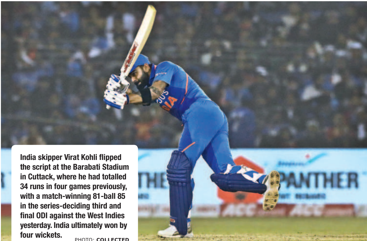
India skipper Virat Kohli flipped the script at the Barabati Stadium in Cuttack, where he had totalled 34 runs in four games previously, with a match-winning 81-ball 85 in the series-deciding third and final ODI against the West Indies yesterday. India ultimately won by four wickets.

Pollard hit two successive boundaries to raise his fifty and pulverised the bowling in the final few overs as West Indies managed 77 runs from the last 30 deliveries.