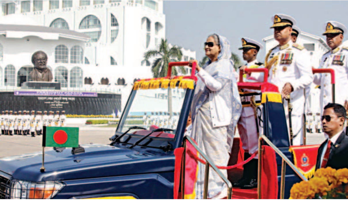
Accompanied by Chief of Naval Staff Admiral Aurangzeb Chowdhury, Prime Minister Sheikh Hasina inspects a parade at Bangladesh Naval Academy in Chattogram yesterday.

PM to newly-commissioned naval officers, hopes navy will become commercial manufacturer of warships