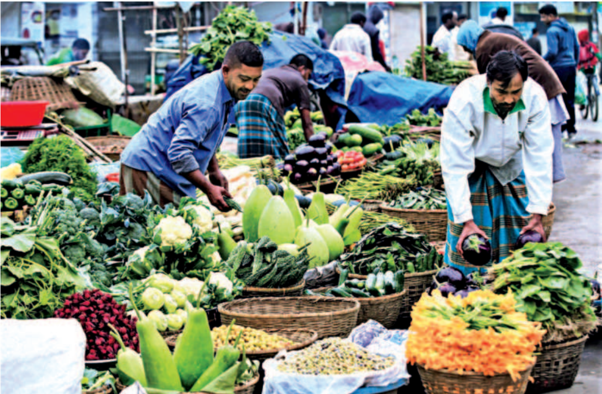
Winter is the season of vegetables. Like elsewhere, varieties of green goodness have started appearing in markets in Sylhet. Locals say despite adequate supply, the price is too high. This photo of vendors arranging vegetables was taken at the city’s Rikabibazar market yesterday, where a kg of cauliflower, cucumber, bitter gourd, okra and tomato was being sold between Tk 65 and Tk 80.