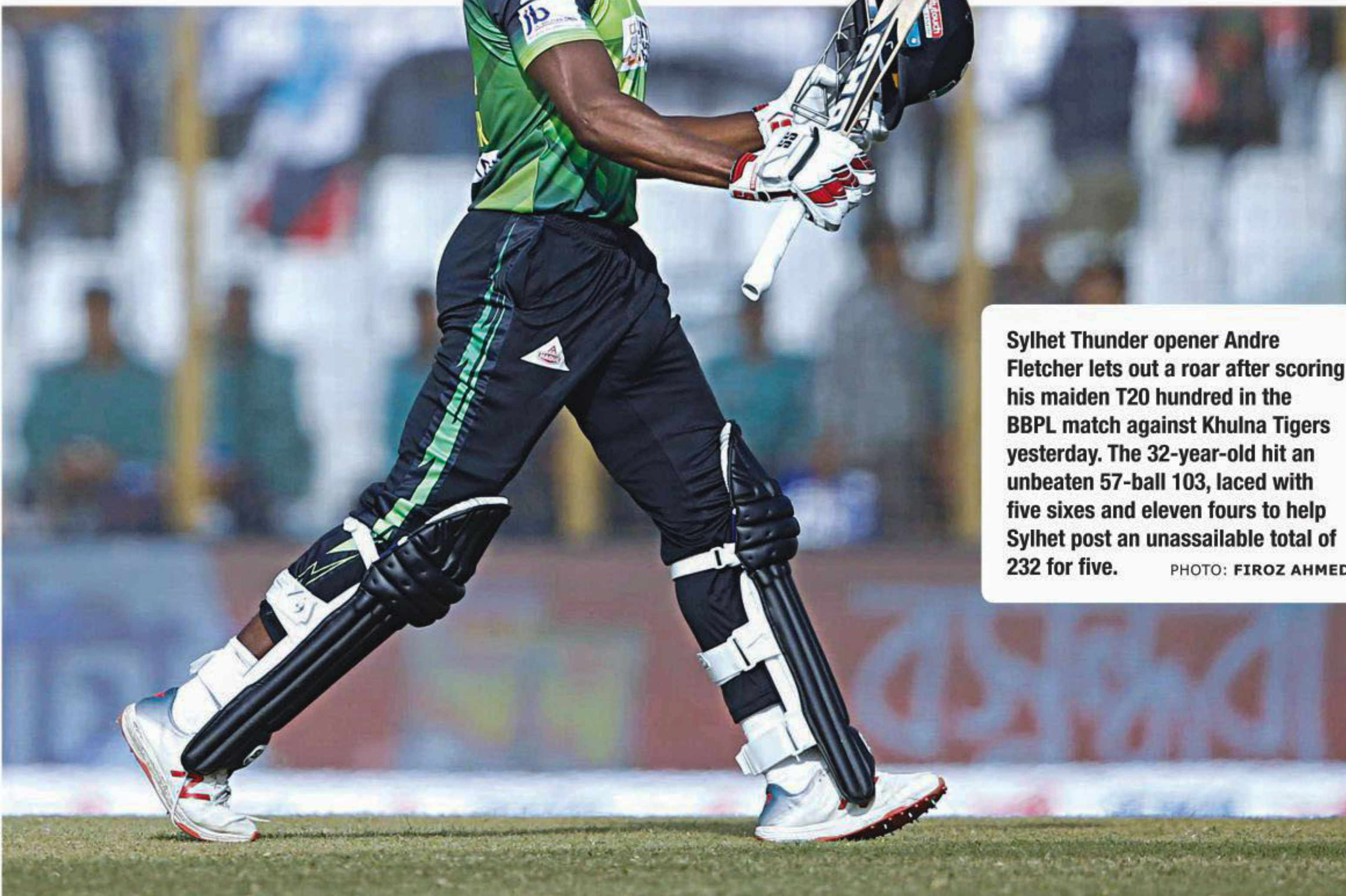
Sylhet Thunder opener Andre Fletcher lets out a roar after scoring his maiden T20 hundred in the BBPL match against Khulna Tigers yesterday. The 32-year-old hit an unbeaten 57-ball 103, laced with five sixes and eleven fours to help Sylhet post an unassailable total of 232 for five.