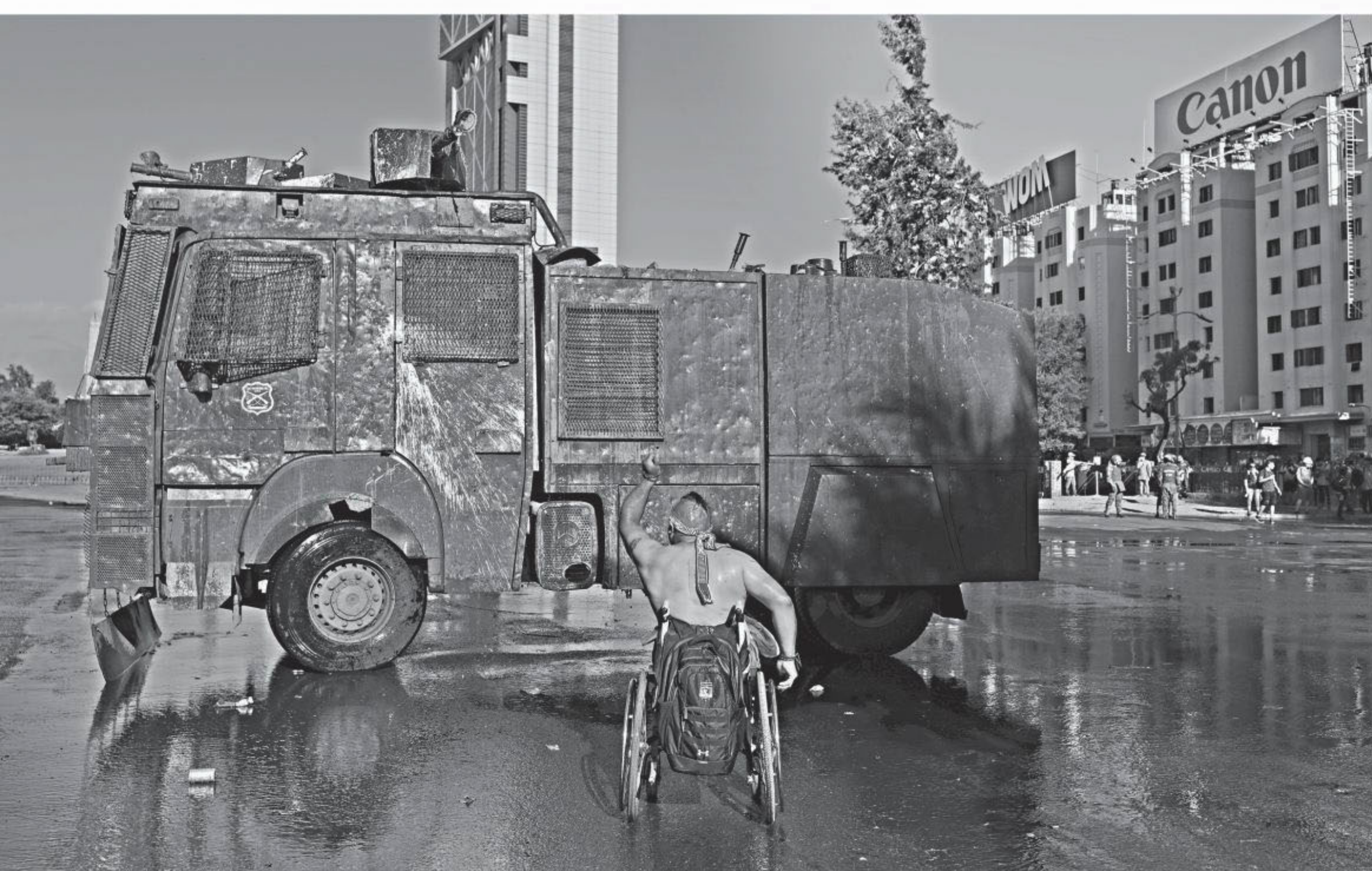
A demonstrator in a wheelchair gestures at an armoured vehicle during a protest against Chile's government in Santiago, Chile, yesterday.