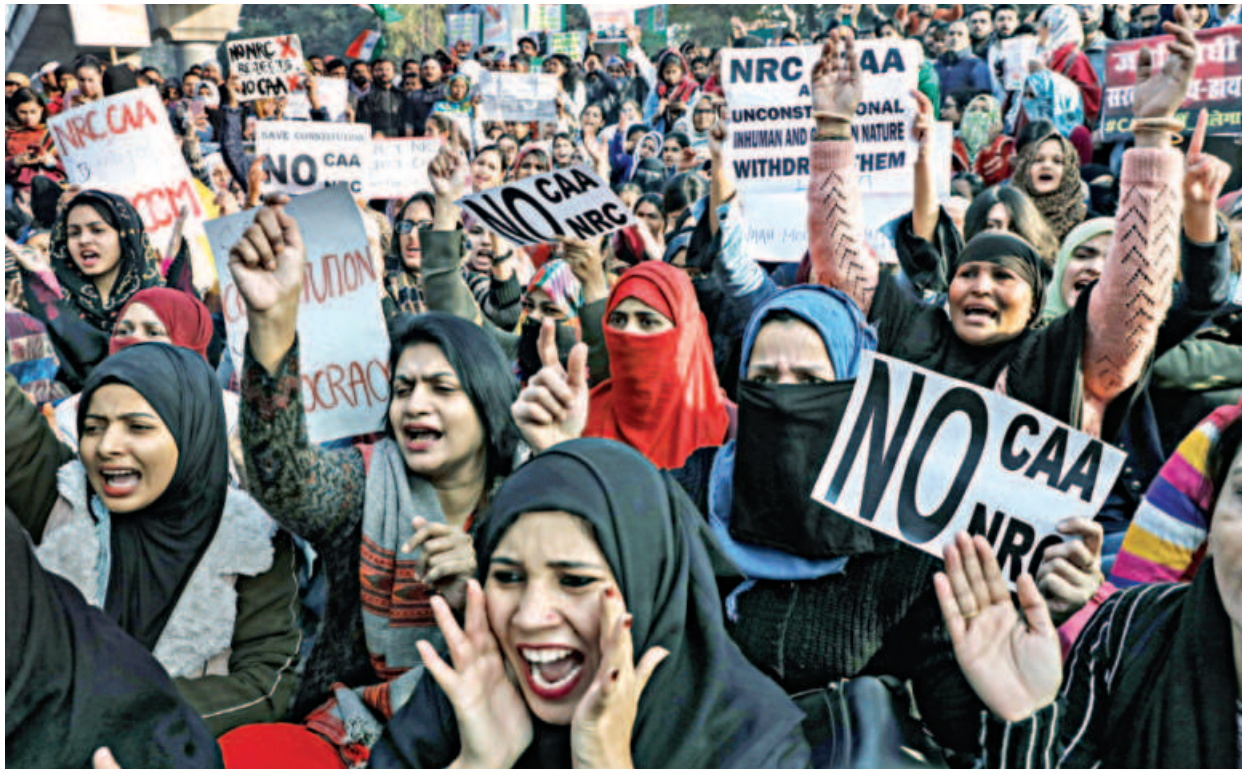
(From left, clockwise) Demonstrators carry posters during a protest against a new citizenship law, outside the Jamia Millia Islamia University in New Delhi, yesterday; demonstrators shout slogans during a protest in Guwahati, Assam; and a woman holds a sign during a protest against the law in Chennai. Thousands of people joined fresh rallies against a contentious citizenship law in India yesterday, with 21 killed so far in the unrest.