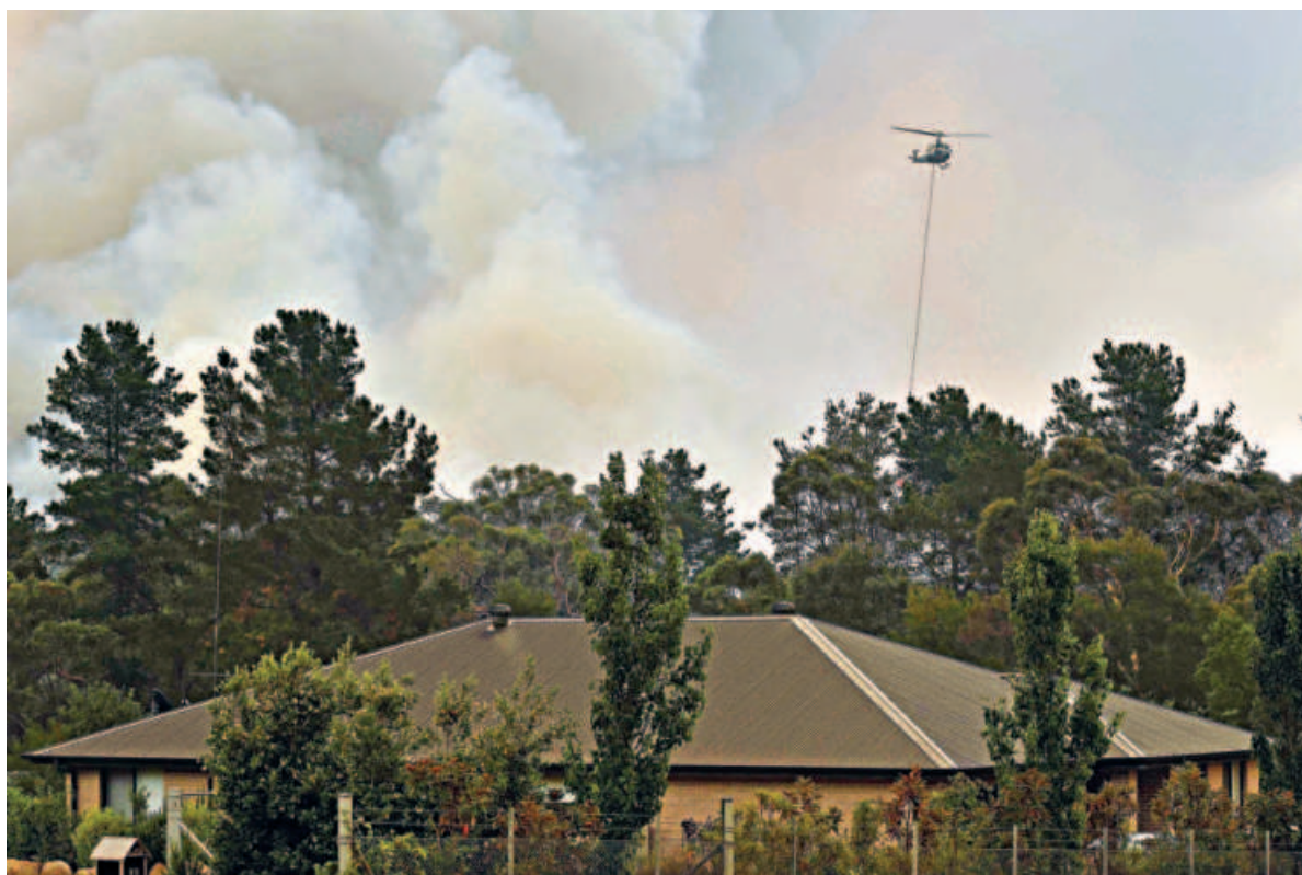
A helicopter prepares to drop water on a large bushfire in Bargo, southwest of Sydney, yesterday.