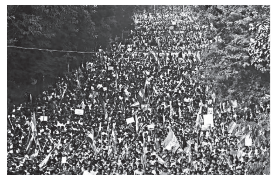
Protesters participate in a mass rally against the Indian government's Citizenship Amendment Act in Kolkata on December 16.

A register of citizens in Assam, finalised recently, left out 1.9 million people, a huge chunk of them Muslims. Now they are facing possible statelessness, detention in camps and even deportation. The BJP-led government intends to replicate the register nationwide with the aim of deporting all "infiltrators" by 2024. Modi's right-hand-man and Home Minister, Amit Shah, has compared illegal immigrants to "termites". Human Rights Watch suspects that "the Indian