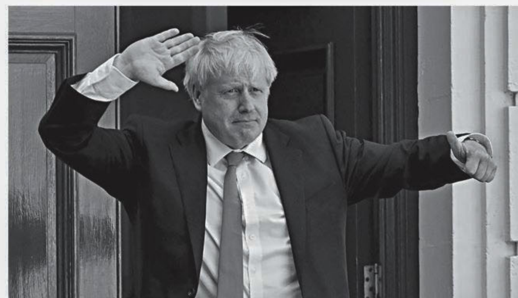
UK Prime Minister Boris Johnson at the Conservative party headquarters in central London.

"The white working class is correct to feel abandoned: it has been,"