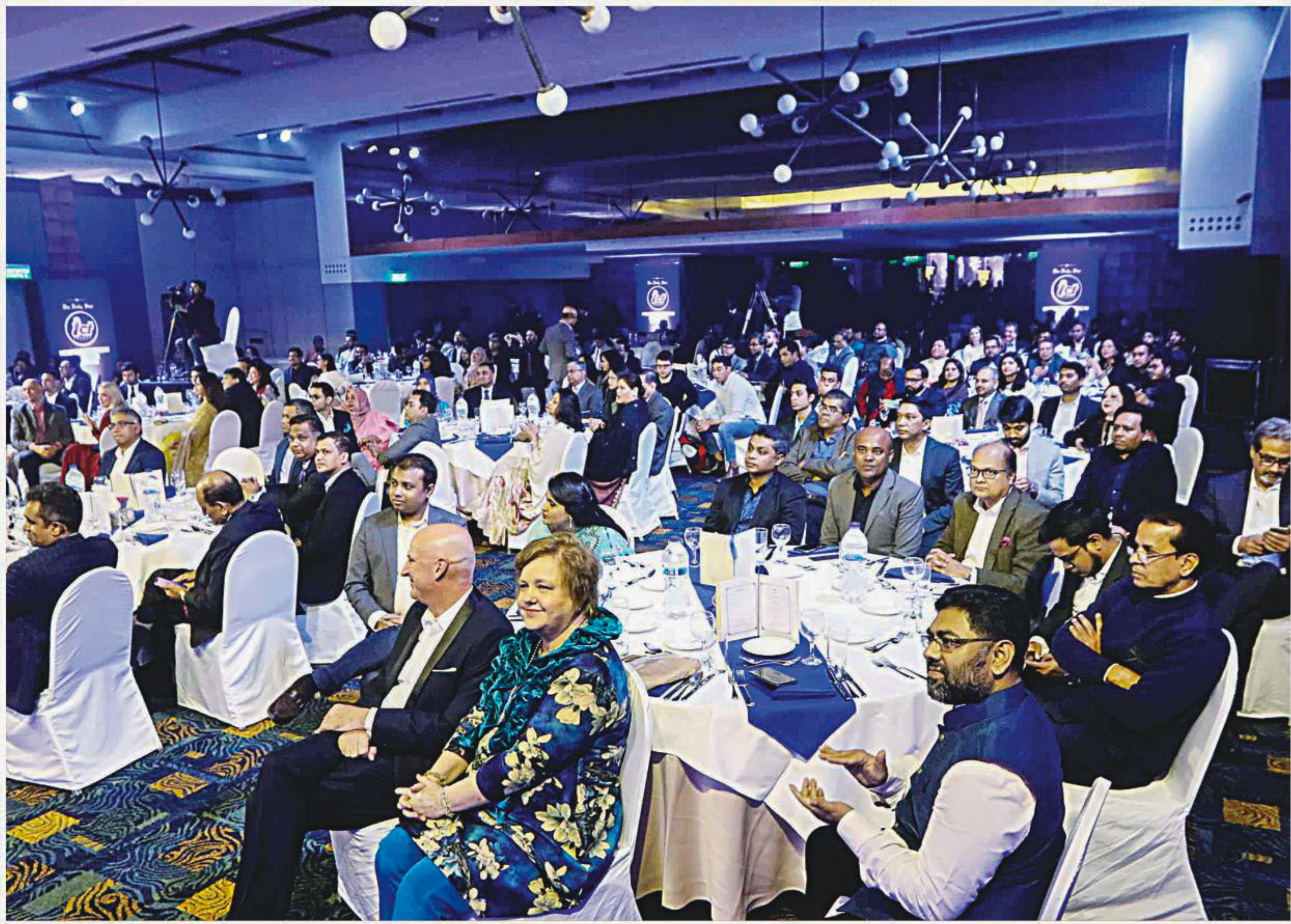
The audience at the The Daily Star ICT Awards ceremony at the capital's Radisson Blu Water Garden Hotel yesterday evening. Two entrepreneurs and four firms won the awards.