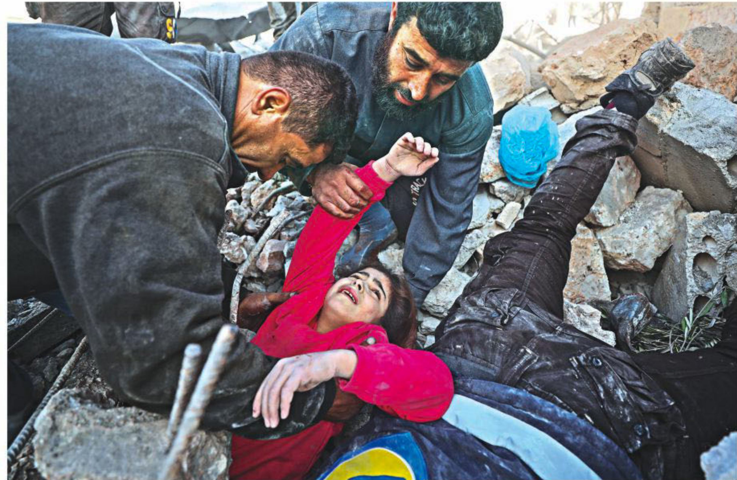
Members of the Syrian Civil Defence, also known as the White Helmets, recover a wounded girl from the rubble of a building following a reported Russian air strike in the village of Tal Mardikh in Syria's northwestern Idlib province, yesterday.

It shows that by 2020, the ranks of male users will shrink by two million people compared to last year's number, and by 2025, there are projected to be six million fewer male tobacco users than in 2018, so around 1.087 billion.