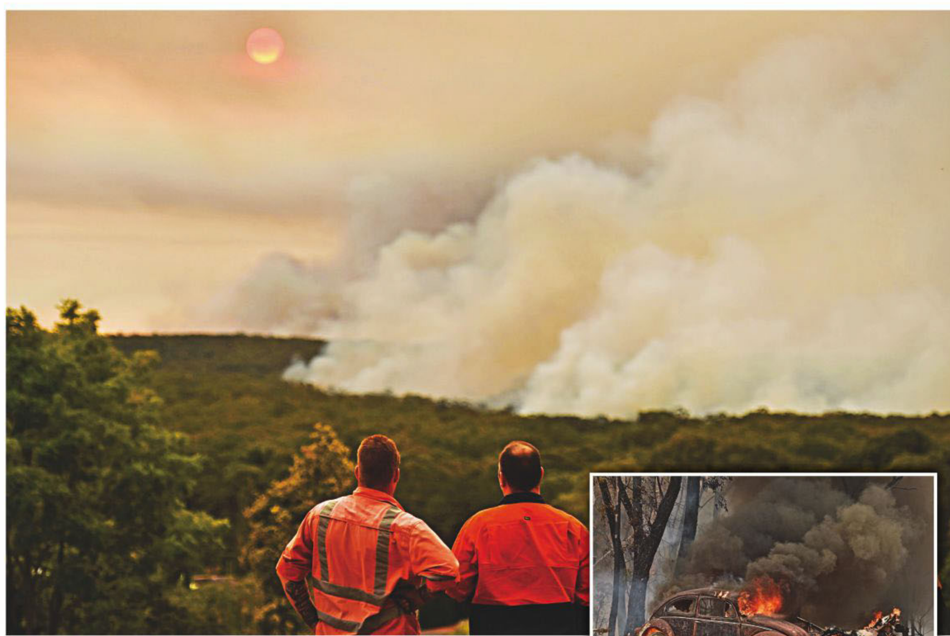
Residents watch a large bushfire as seen from Bargo, 150km southwest of Sydney, yesterday. Inset, An old car burns from bushfires in Balmoral area.