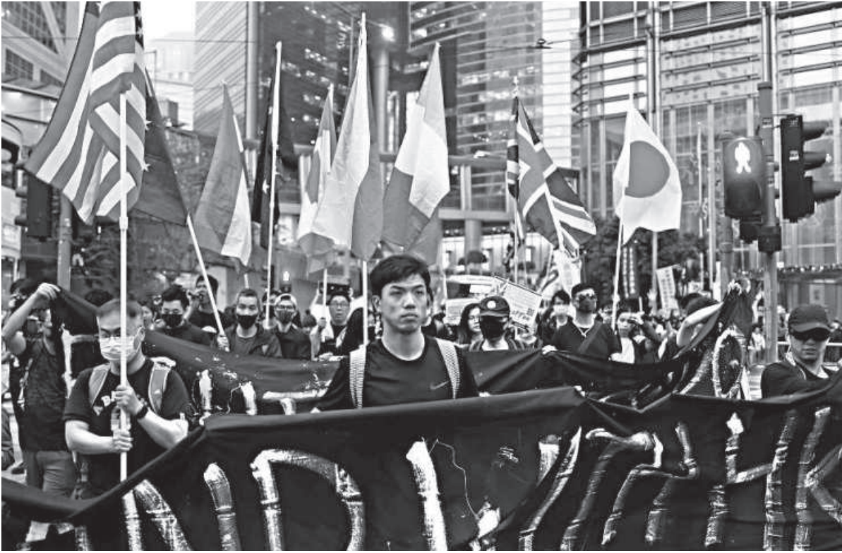
Hong Kong protesters rally outside diplomatic missions in the city yesterday to urge foreign governments to follow the United States and pass human rights bills to raise pressure on Beijing and support their pro-democracy campaign.

Five Arab nations rank among 10 countries with lowest death rates