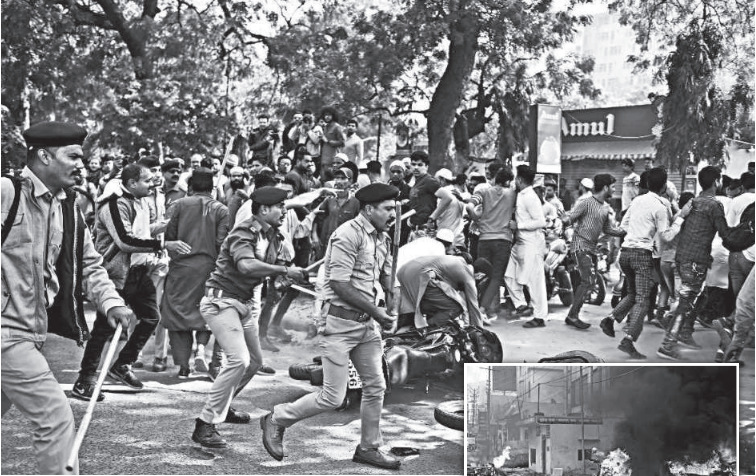
Gujarat police react to disperse protesters during a demonstration against India's new citizenship law in Ahmedabad yesterday. Inset, Police motorcycles burn after being set on fire during demonstrations in Lucknow.

Lebanese academic and former minister Hassan Diab received the backing of Shia group Hezbollah and yesterday looked set to be named the crisis-racked country's new prime minister. Caretaker premier Saad Hariri pulled out of the race on Wednesday and his bloc did not nominate any candidate when much-delayed consultations to form a new government got under way at the presidential palace. The nomination of Diab would yield a lopsided government.