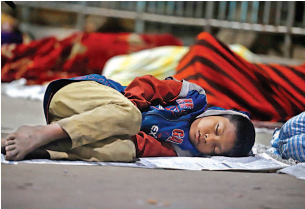
A child curled up on the ground in Kamalapur Railway Station in the capital early yesterday. As a mild cold wave sweeps across the country, people of the lower income group, especially children and the elderly, suffer the most.