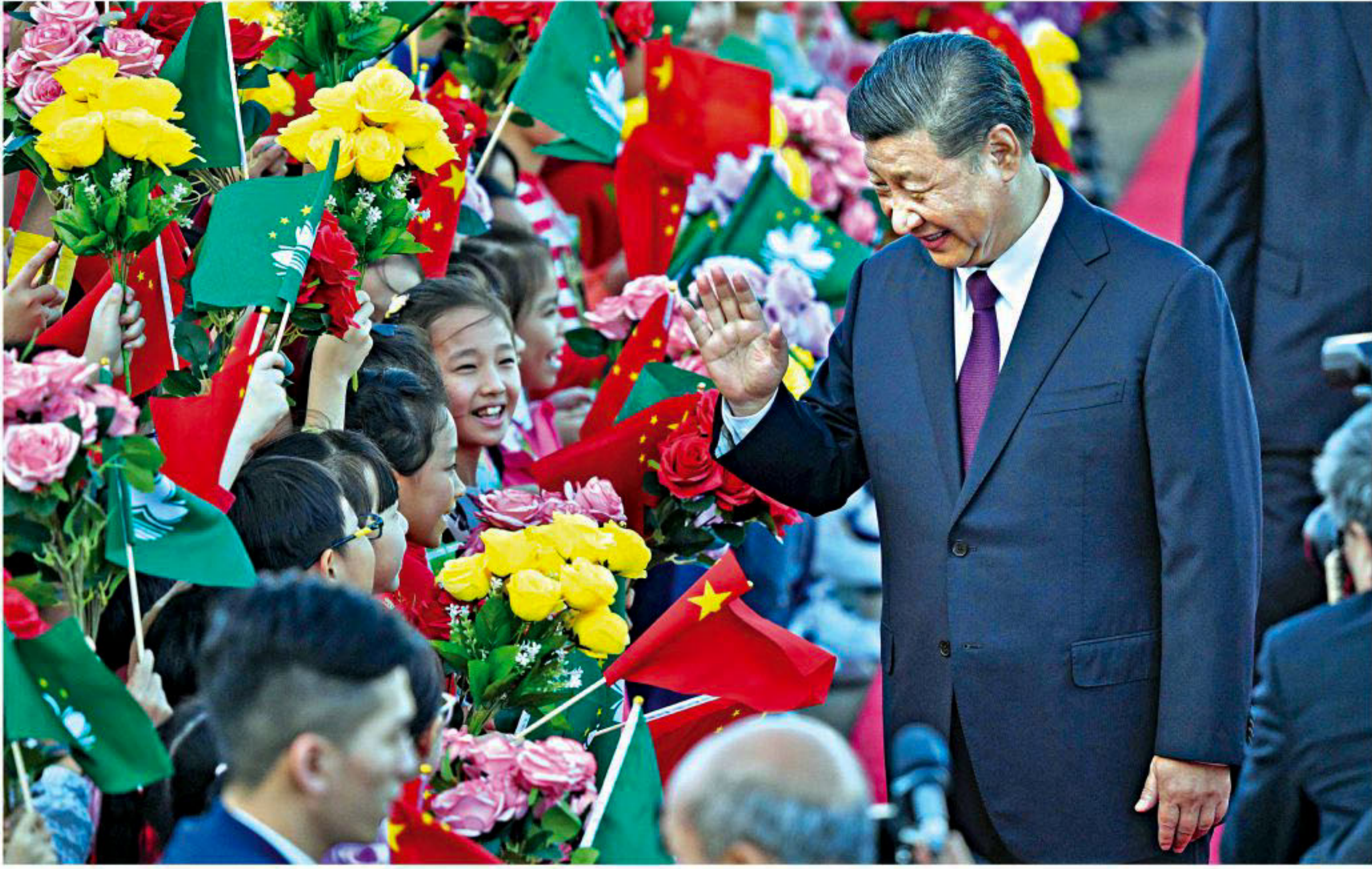
China's President Xi Jinping greets children waving the flags of China and Macau upon his arrival at Macau's international airport in Macau yesterday, ahead of celebrations for the 20th anniversary of the handover from Portugal to China.