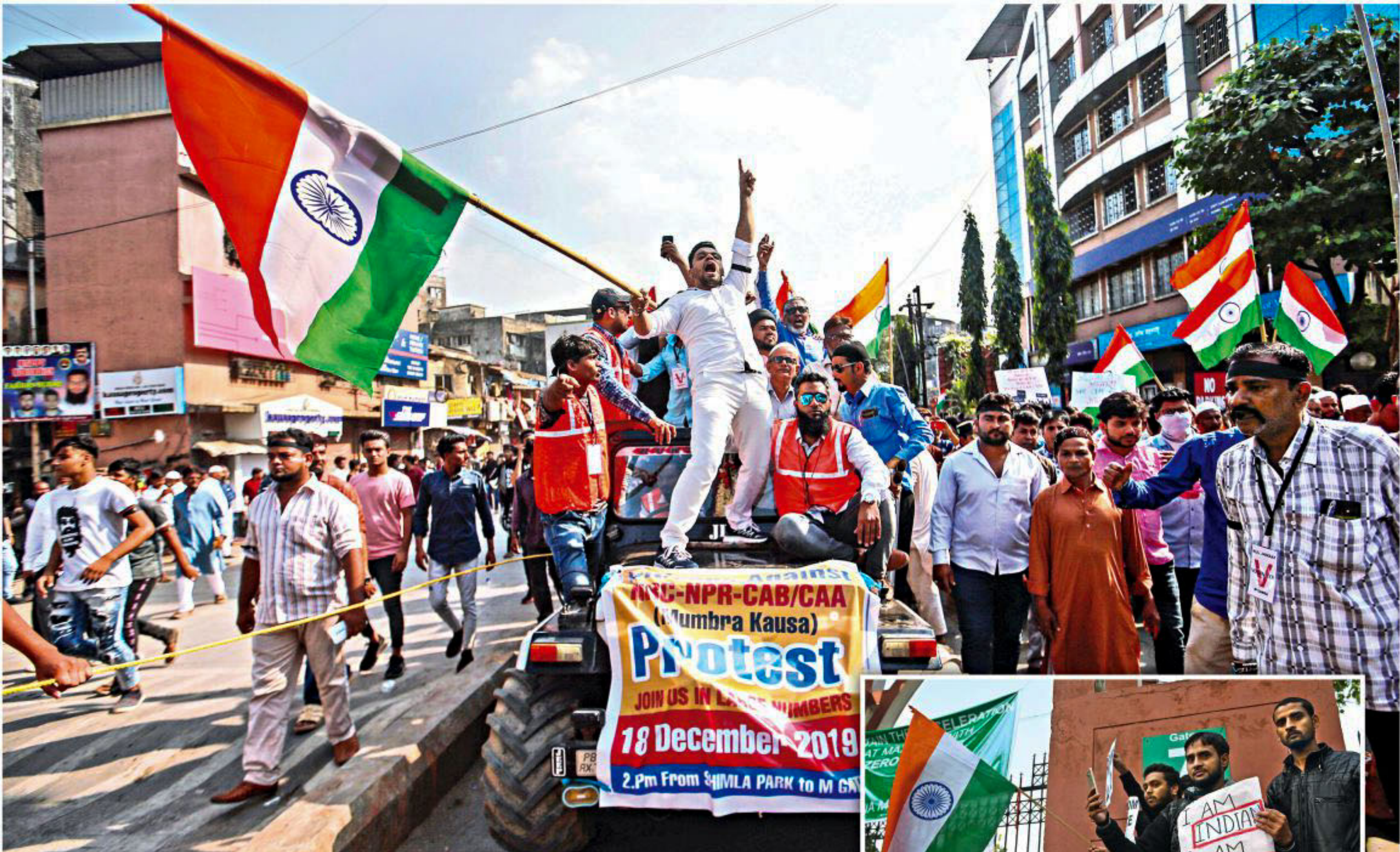
Demonstrators wave the national flag of India and shout slogans during a protest against a new citizenship law, on the outskirts of Mumbai, India yesterday. Inset, Students and supporters hold placards as they protest outside Jamia Millia Islamia university against the law in New Delhi.

Fourteen people were killed and 13 were missing after Boko Haram jihadists attacked a fishing village in western Chad on Tuesday, government officials said. "There were 14 dead, five wounded and 13 missing in the attack" near the village of Kaiga on the shores of Lake Chad, Imouya Souabebe, the prefect of the region, said. Kaiga lies in marshland in a remote region where the borders of four countries meet.