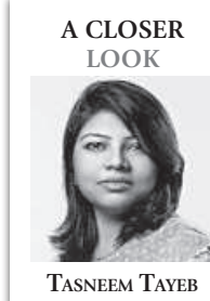
A CLOSER LOOK