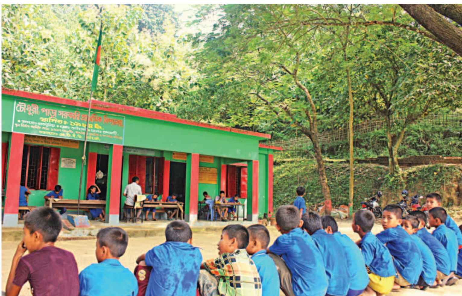
Students of Chowdhury Para Government Primary School, in Rangamati's hilly upazila of Kawkhali, eagerly wait under a tree outside their school building for afternoon shift to start. The photo was taken recently.