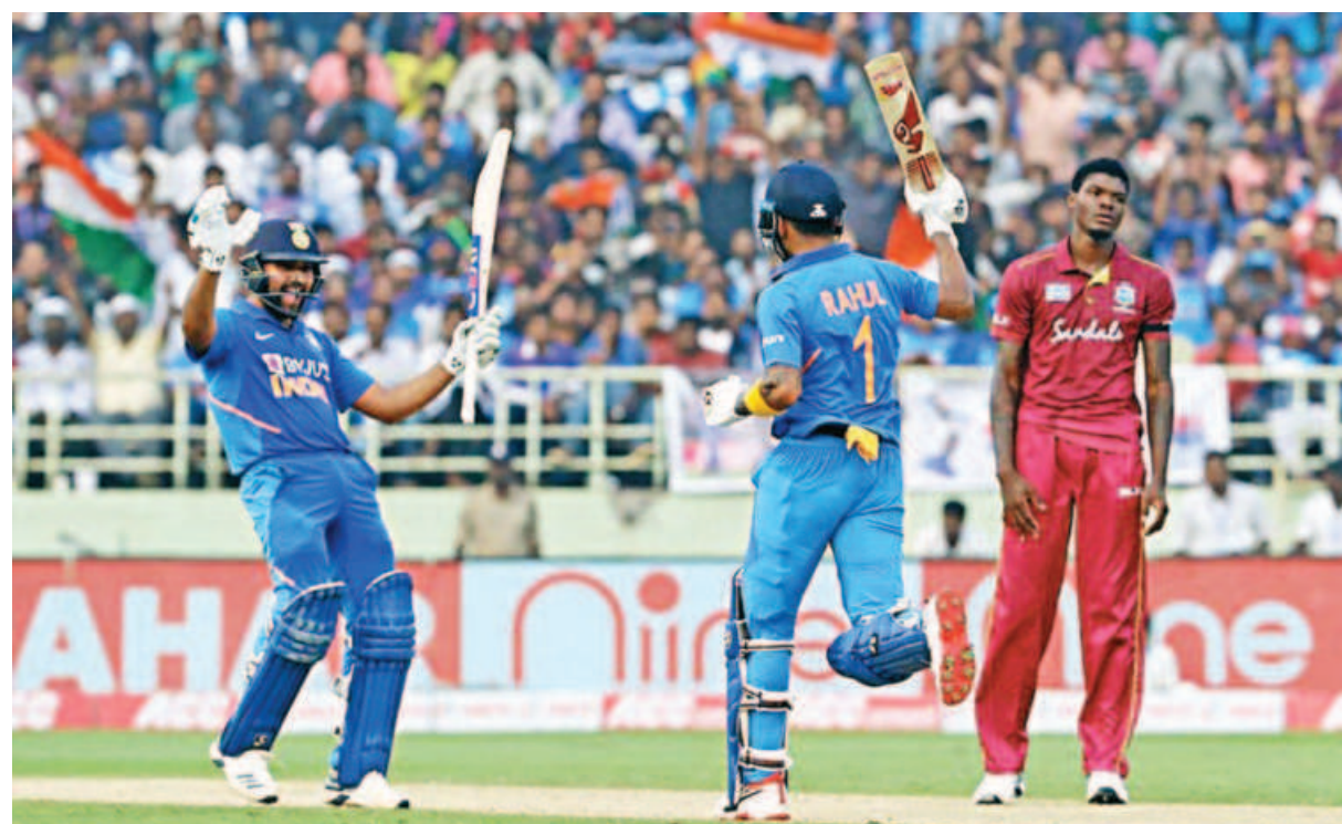
Indian openers Rohit Sharma (L) and KL Rahul starred in a run-fest during the second ODI against West Indies in Visakhapatnam yesterday. The pair hammered quickfire tons to achieve India's first 200-plus opening stand against West Indies.

SCORES IN BRIEF INDIA: 387 for 5 (Sharma 159, Rahul 102, Iyer 53; Cottrell 2-83, Pollard 1-20) WEST INDIES: 280 all out in 43.3 overs (Hope 78, Pooran 75, Paul 45; Yadav 3-52, Shami 2-39) Result: India won by 107 runs Player-of-the-match: Rohit Sharma