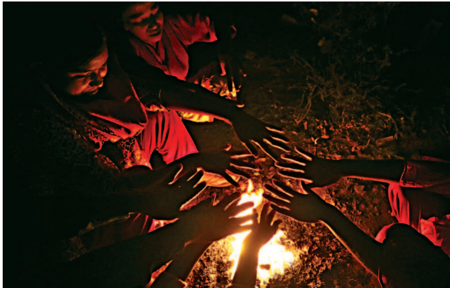
Homeless people trying to keep warm by setting rubbish on fire by the rail lines at the capital's Karwanbazar yesterday evening. The sudden drop in temperature caught many people by surprise.