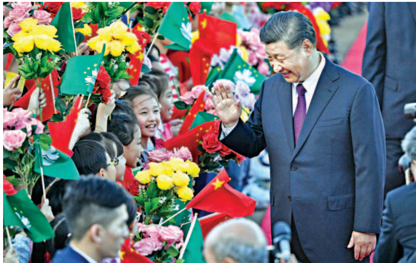
China's President Xi Jinping greets children waving the flags of China and Macau upon his arrival at Macau's international airport in Macau yesterday, ahead of celebrations for the 20th anniversary of the handover from Portugal to China.