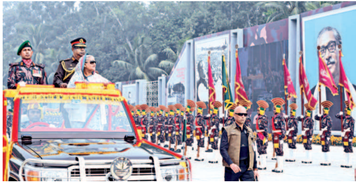
Prime Minister Sheikh Hasina attending a parade of the Border Guard Bangladesh at its headquarters in the capital's Pilkhana yesterday morning, marking the BGD Day 2019.

"There has been confusion between the list of terrorists and the list of Razakars. Hadn't Ziaur Rahman, Ershad or Khaleda Zia used the list, the problem would not have appeared," said the prime minister.