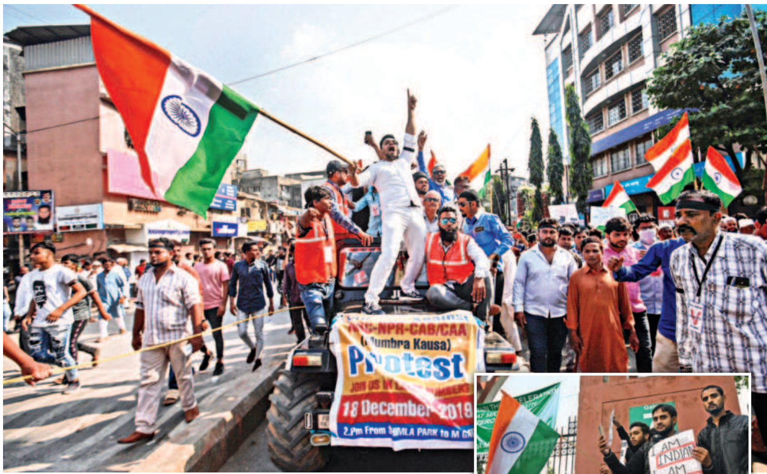
Demonstrators wave the national flag of India and shout slogans during a protest against a new citizenship law, on the outskirts of Mumbai, India yesterday. Inset, Students and supporters hold placards as they protest outside Jamia Millia Islamia university against the law in New Delhi.

Fourteen people were killed and 13 were missing after Boko Haram jihadists attacked a fishing village in western Chad on Tuesday, government officials said. "There were 14 dead, five wounded and 13 missing in the attack" near the village of Kaiga on the shores of Lake Chad, Imouya Souabebe, the prefect of the region, said. Kaiga lies in marshland in a remote region where the borders of four countries meet.