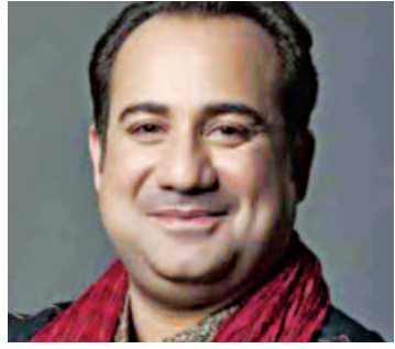
Rahat Fateh Ali Khan