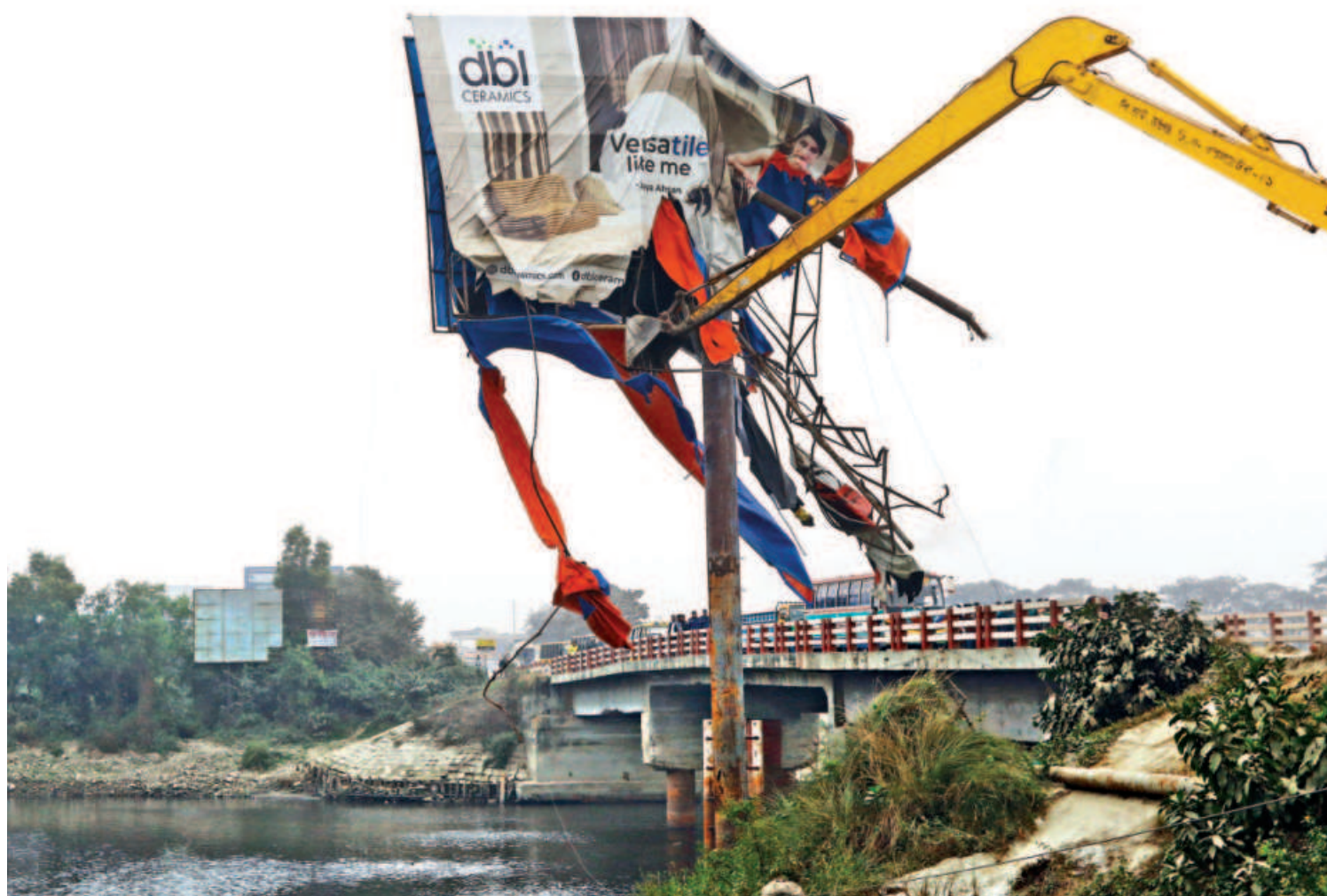
The arm of an excavator tearing an illegal billboard on the bank of the Turag at Dhaur in Ashulia on the outskirts of the capital yesterday. Bangladesh Inland Water Transport Authority removed illegal structures from the river banks throughout the day.