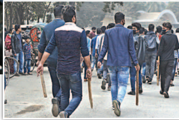
Activists of Muktijuddho Moncho and Bangladesh Sadharan Chhatra Adhikar Sangrakkhan Parishad face off in front of Raju Memorial Sculpture at Dhaka University. Inset, Moncho activists walking with sticks in their hands. The photos were taken yesterday.