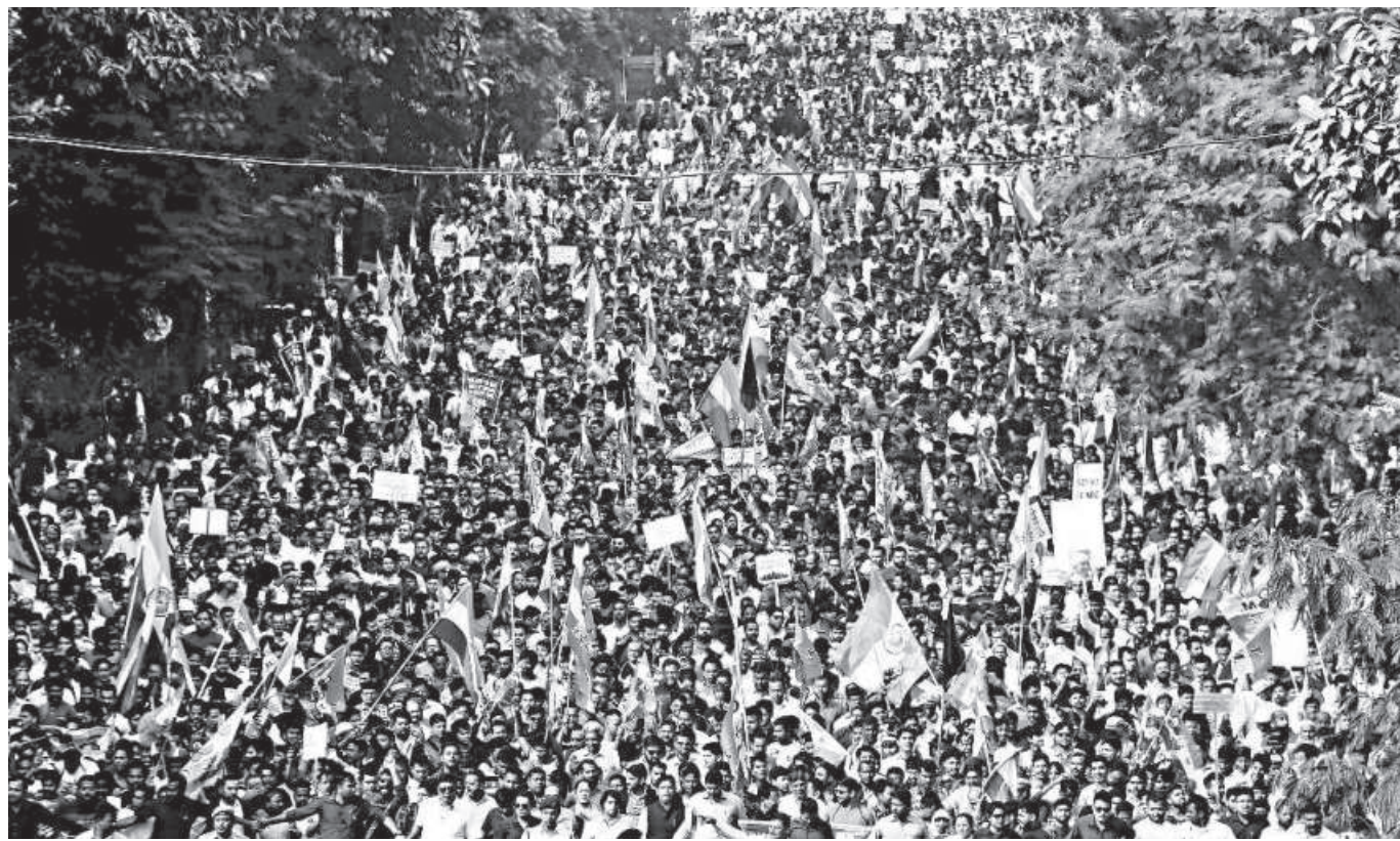
Supporters and activists of Trinamool Congress participate in a mass rally to protest against the Indian government's Citizenship Amendment Act (CAA), in Kolkata on December 16, 2019.

Ideally the focus now should be on constructive civil dialogue. And the Indians must make sure that no disruptive elements can create chaos in the name of civilian protests. The people must maintain the peaceful means of protests, in line with the tradition of the Mahatma's Satyagraha and nonviolence resistance, because it is only through peaceful