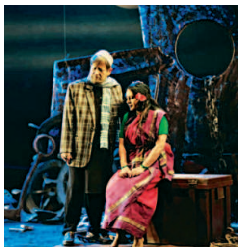
Kalo Joler Kabbo