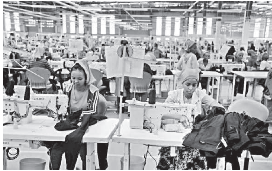
The low labour cost in the Ethiopian apparel sector can lead to disenchanted workers not performing effectively.

To my mind, the rising interest in Ethiopia from brands and retailers should summon a