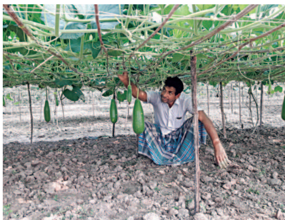
A farmer tends his gourd plants at Talina village in Jhenidah's Kotchandpur upazila.

"We always keep vigilance on the farmers so that the latter can get bumper production," he said.