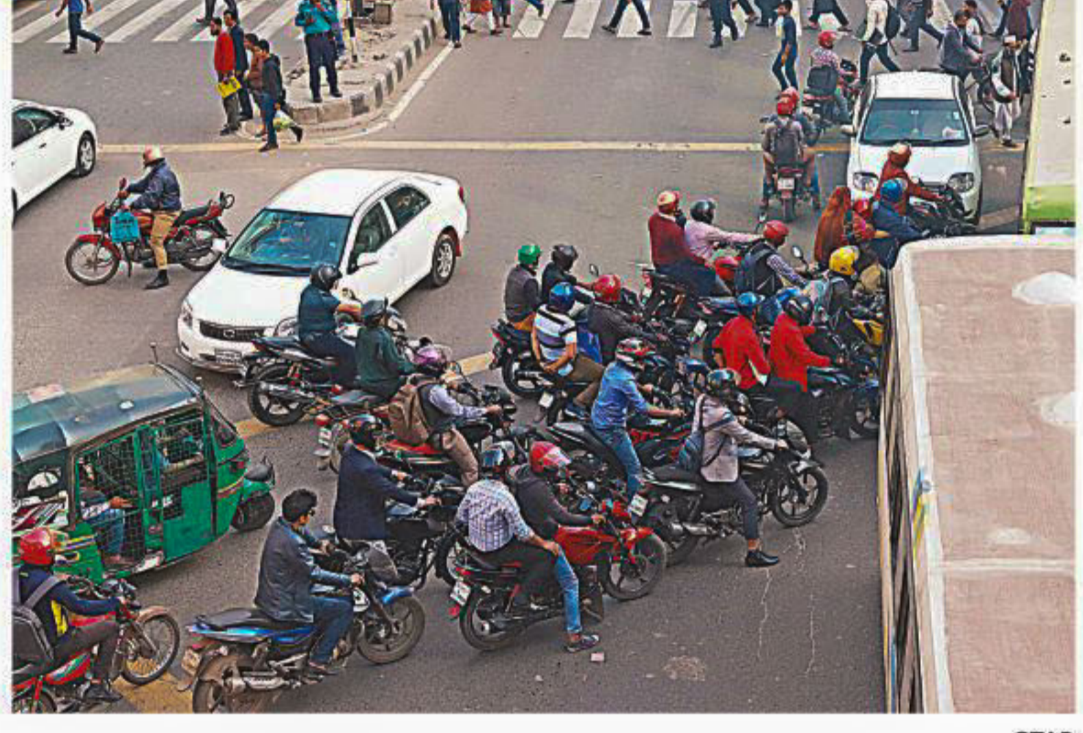
Price cuts and increasing purchasing capacity boosted sales of motorbikes.

And, they will have to apply to the NBR to avail 10 percent tax benefit, down from 35 percent regular tax rate for companies, according to the NBR.