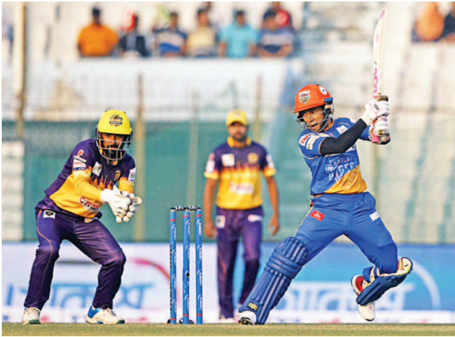
Mushfiqur Rahim was in imperious form as he hit a 51-ball 96 to guide Khulna Tigers past a stiff target of 190 set by Rajshahi Royals in the BBPL match at the Zahur Ahmed Chowdhury Stadium in Chattogram yesterday.