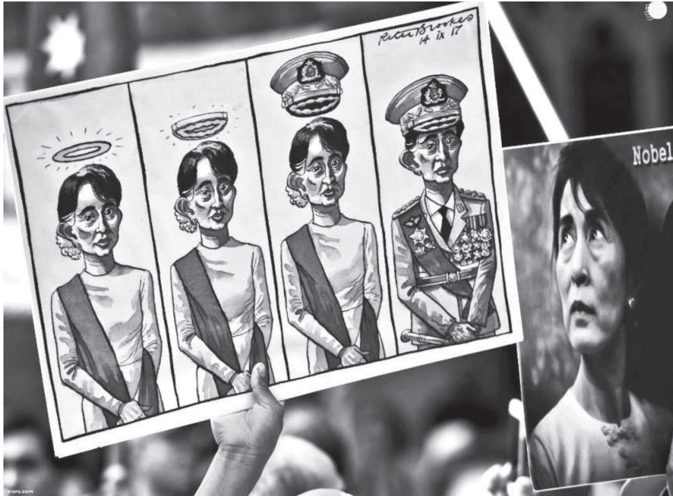
Aung San Suu Kyi, once garlanded as a global rights champion, has seen a sharp fall from grace due to her persistent refusal to stop the genocide and ethnic cleansing of the Rohingyas in Myanmar.

In 1991, Suu Kyi was applauded for her "courage in the face of tyranny." Today, because of her complicity with the top brass of the military, she is loathed even by her former admirers. She finally laid bare her true colours by defending the indefensible charges of genocide against the generals at the International Court of Justice (ICJ) in The Hague. Let's forget, these are the people who once imprisoned her for her struggle for human rights and democracy. Yes, she forgot her own mantra: "The only real prison is fear and the only real freedom is