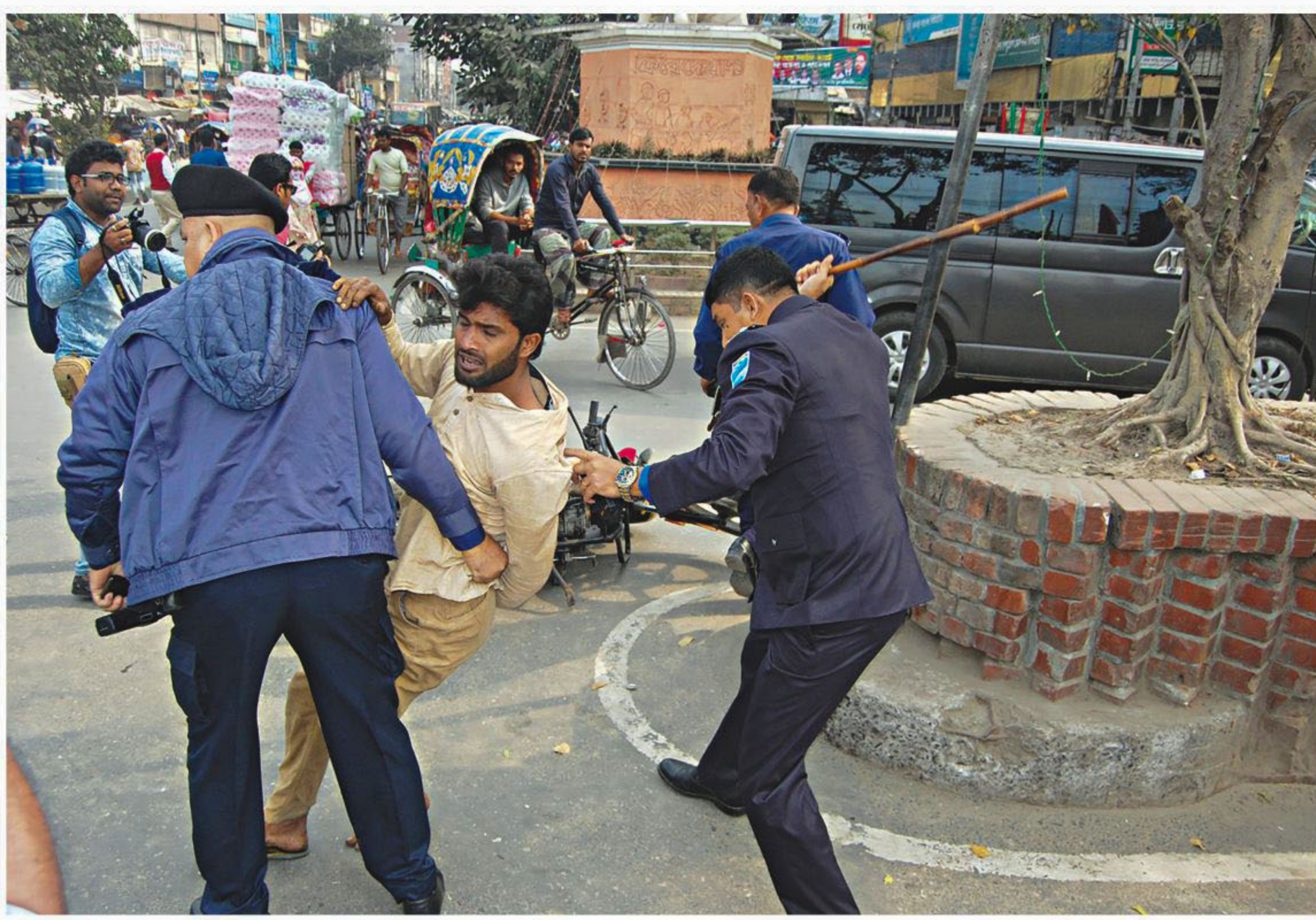
Policemen baton-charge a Swetchhasebak Dal activist after obstructing a procession of the pro-BNP organisation on Bangabandhu Road in Narayanganj yesterday morning. The law enforcers also picked up several activists following a scuffle with cops.