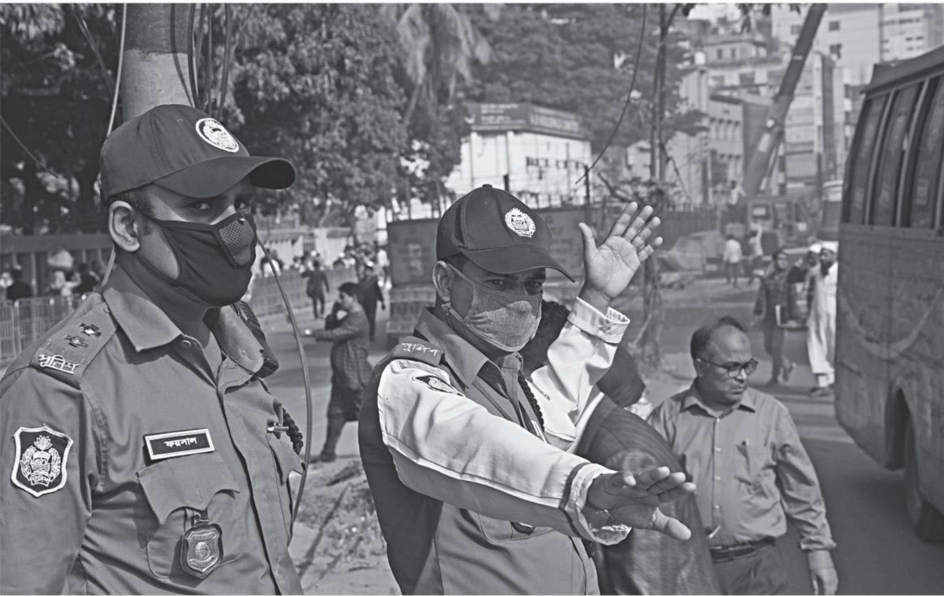
Two traffic policemen wear dust masks in an attempt to minimise health risks of inhaling polluted air. The photo was taken near Dhaka's Jatiya Press Club area yesterday.