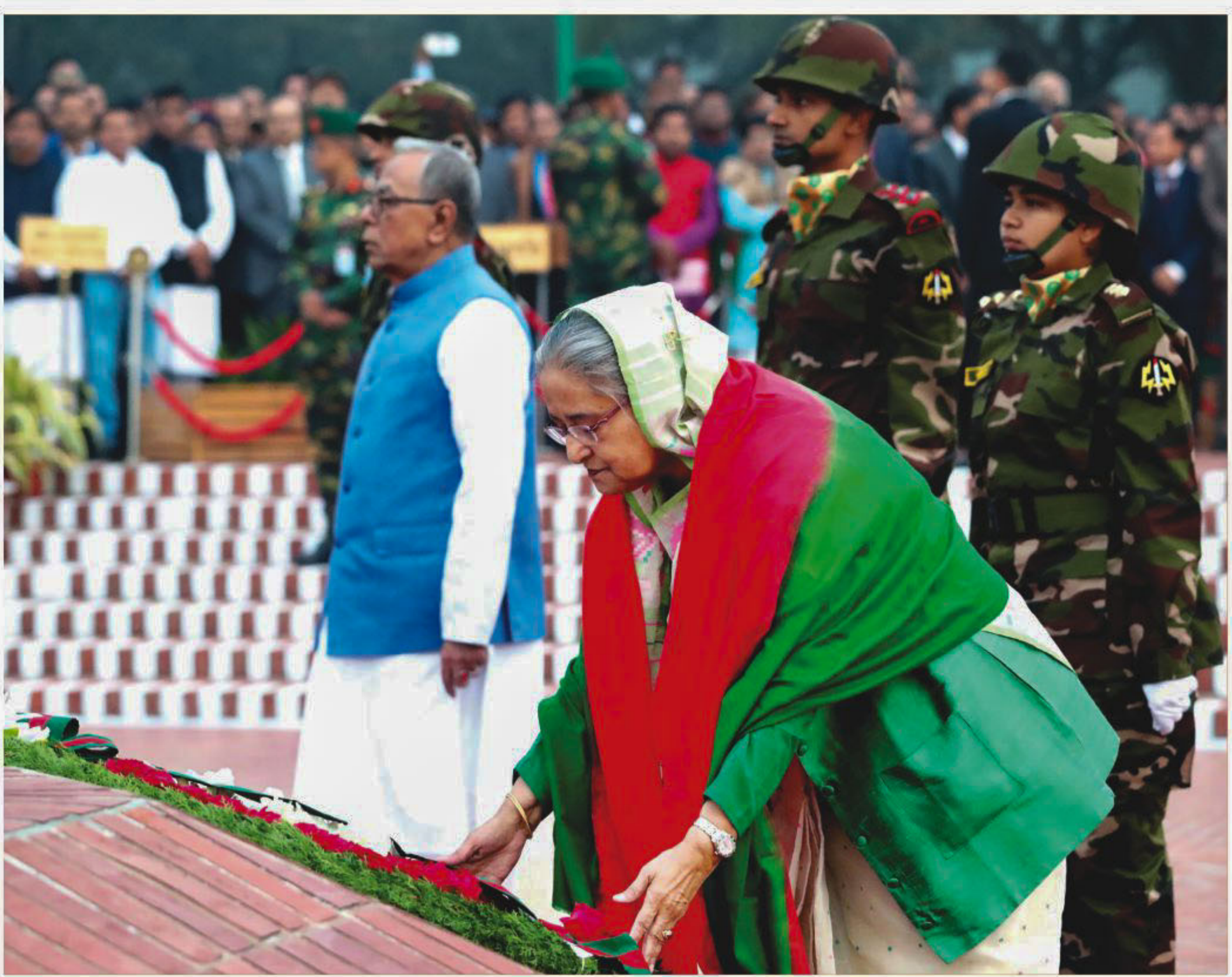
Prime Minister Sheikh Hasina places a wreath as President Abdul Hamid stands in silence at the National Martyrs' Memorial in Savar, paying tribute to the war heroes on the Victory Day yesterday.