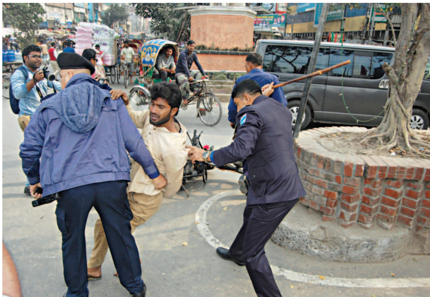
Policemen baton-charge a Swetchhasebak Dal activist after obstructing a procession of the pro-BNP organisation on Bangabandhu Road in Narayanganj yesterday morning. The law enforcers also picked up several activists following a scuffle with cops.