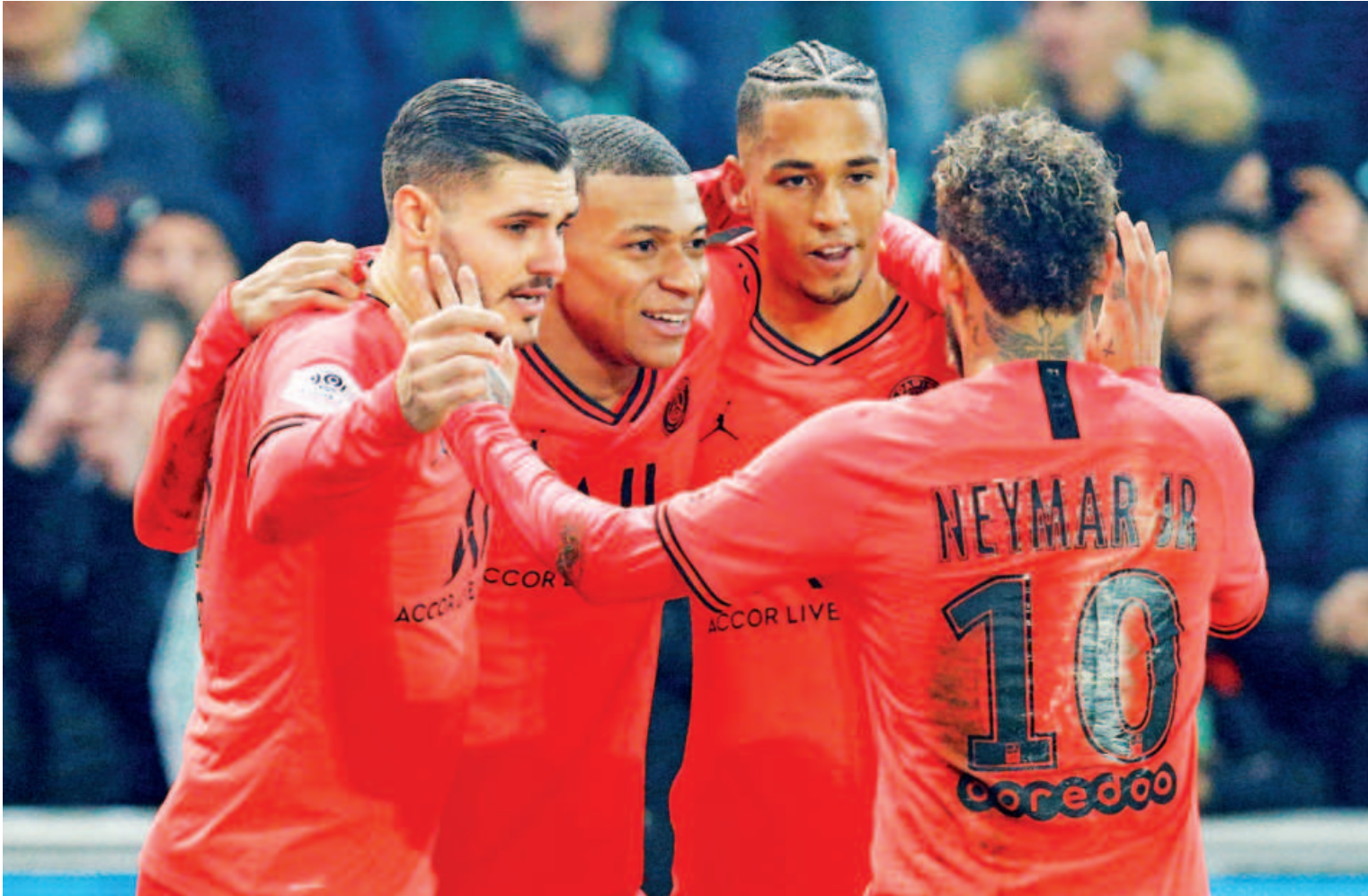
PSG forward Kylian Mbappe (2nd from L) celebrates with teammates after scoring their fourth goal, and his second, in a Ligue 1 encounter with AS Saint-Etienne at the Stade Geoffroy-Guichard on Sunday. Leandro Paredes and Mauro Icardi added one apiece to ensure a 4-0 win.