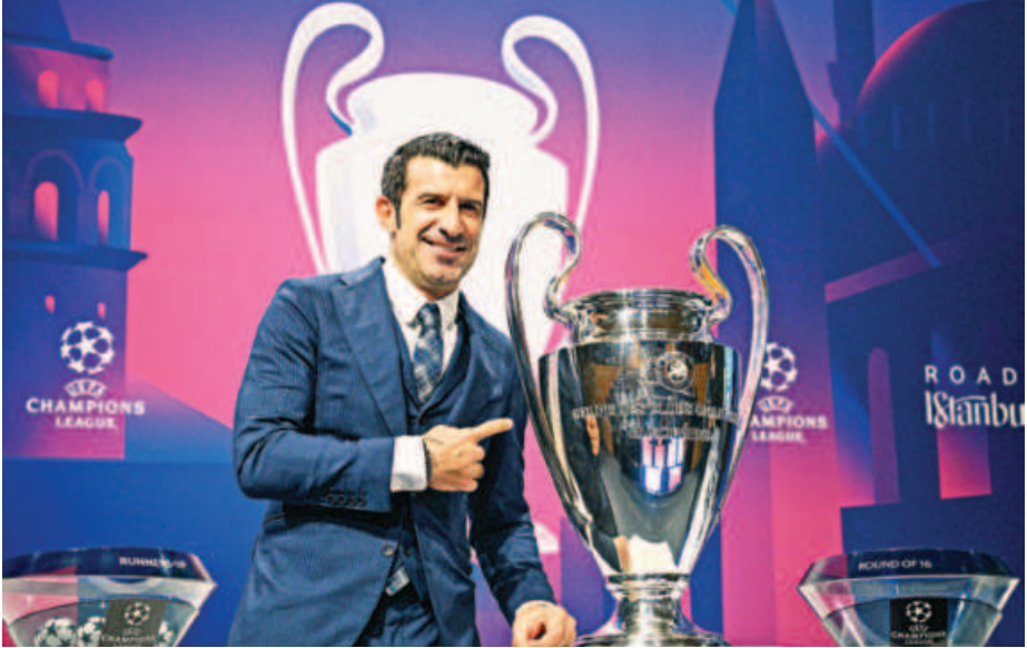
Former Portugal international Luis Figo poses with the Champions League trophy during the last 16 draw ceremony for the tournament in Nyon yesterday.

the group stage and will be trying to avoid a fourth successive last-16 exit, will take on 1997 champions Dortmund. Barcelona will play Napoli for the first time as the Catalan giants, five-time European champions, attempt to move on from last season's painful semi-final loss to Liverpool. Italian champions Juventus and Cristiano Ronaldo will fancy their chances of overcoming French side Lyon, who lost captain Memphis Depay to a season-ending injury Sunday. Tottenham Hotspur, beaten 2-0 by Liverpool in last season's final in Spain, will lock horns with Bundesliga leaders RB Leipzig, who are through to the knockout stages for the first time. This is the first time since the current Champions League format was introduced in 2003 that every club through to the last 16 has come from Europe's biggest five domestic leagues. The first legs will be played over February 18-19 and February 25-26 with the return fixtures scheduled for March 10, 11, 17 and 18. The final is on May 30 at the Ataturk Stadium in Istanbul, where Liverpool won a thrilling 2005 final on penalties against AC Milan.