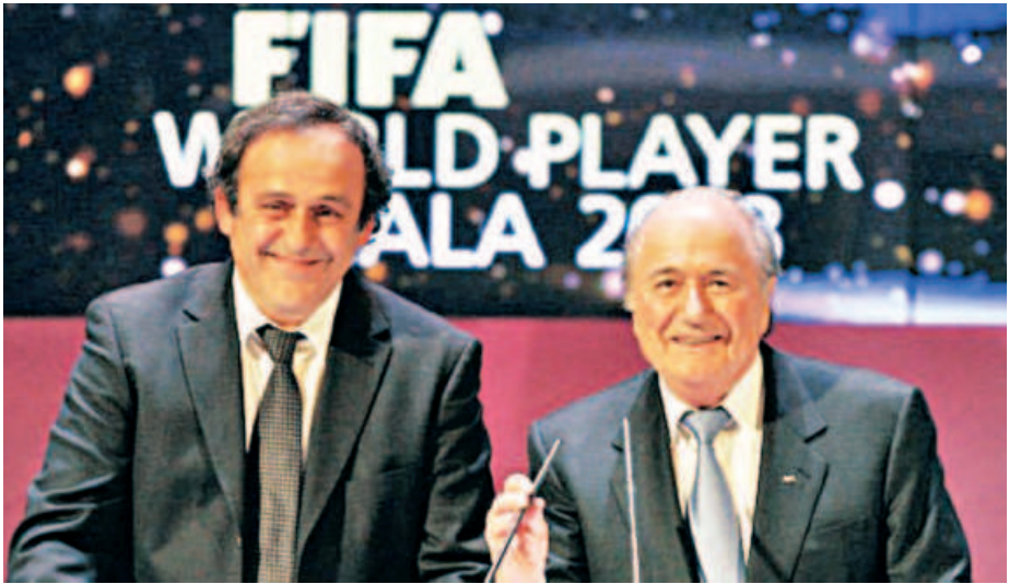
In a recent turn of events, FIFA has filed claims against former FIFA President Joseph Blatter and former FIFA Vice-President Michel Platini, seeking restitution for the 2 million francs 'unduly paid to Platini' back in February 2011.