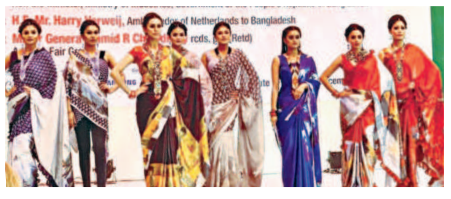
Fashion show on Zamindari style sarees and modern trends in Bangladeshi sarees, painted by Jamal Ahmed and Kanak Chanpa Chakma.

The main attraction of the event was a fifty feet canvas, painted by Ekushey Padak awardee and internationally renowned artist Jamal Ahmed with