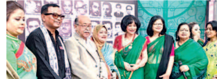
The guests and organisers paid tribute to the martyrs.