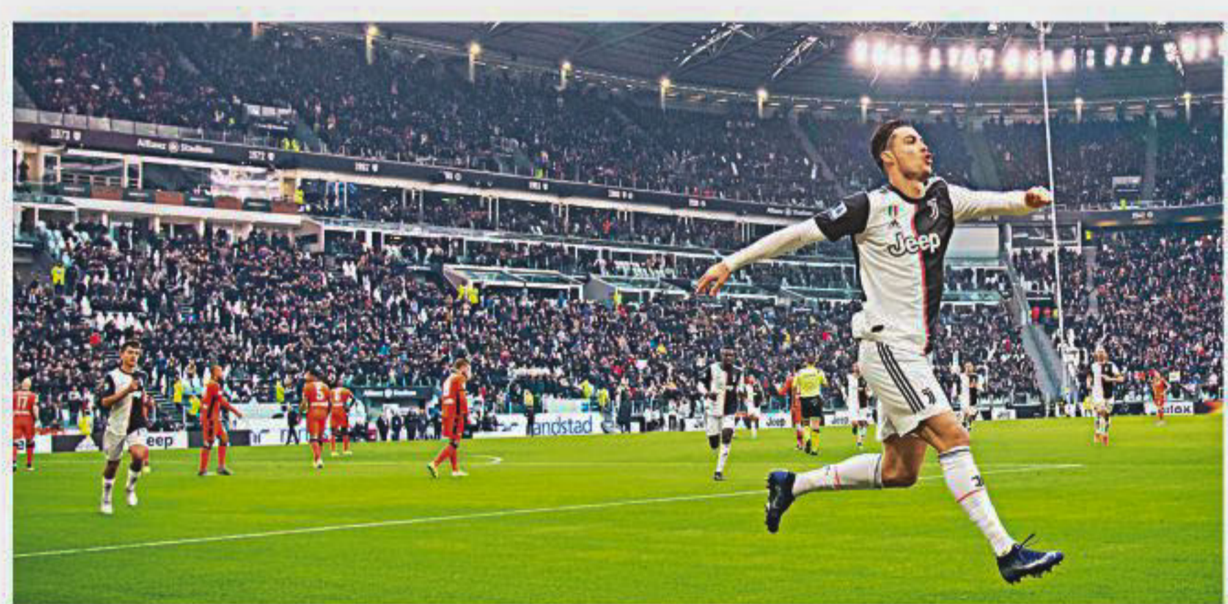
Juventus talisman Cristiano Ronaldo (R) celebrates one of his two goals against Udinese in a Serie A encounter at the Allianz Stadium yesterday. Leonardo Bonucci scored the third as Juventus walked away 3-1 victors.

Theo Hernandez had a goal ruled out following a Franck Kessie handball in the buildup, with Rafael Leao hitting the crossbar and the post. Stefano Pioli's side failed to make it three wins in a row and sit 10th with Sassuolo four places and five points below.