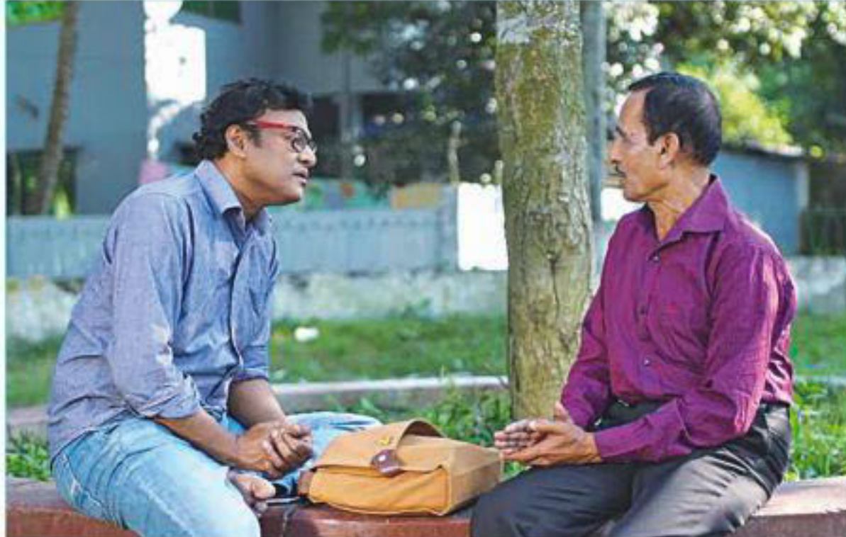
Shadhinotar Shesh Juddho