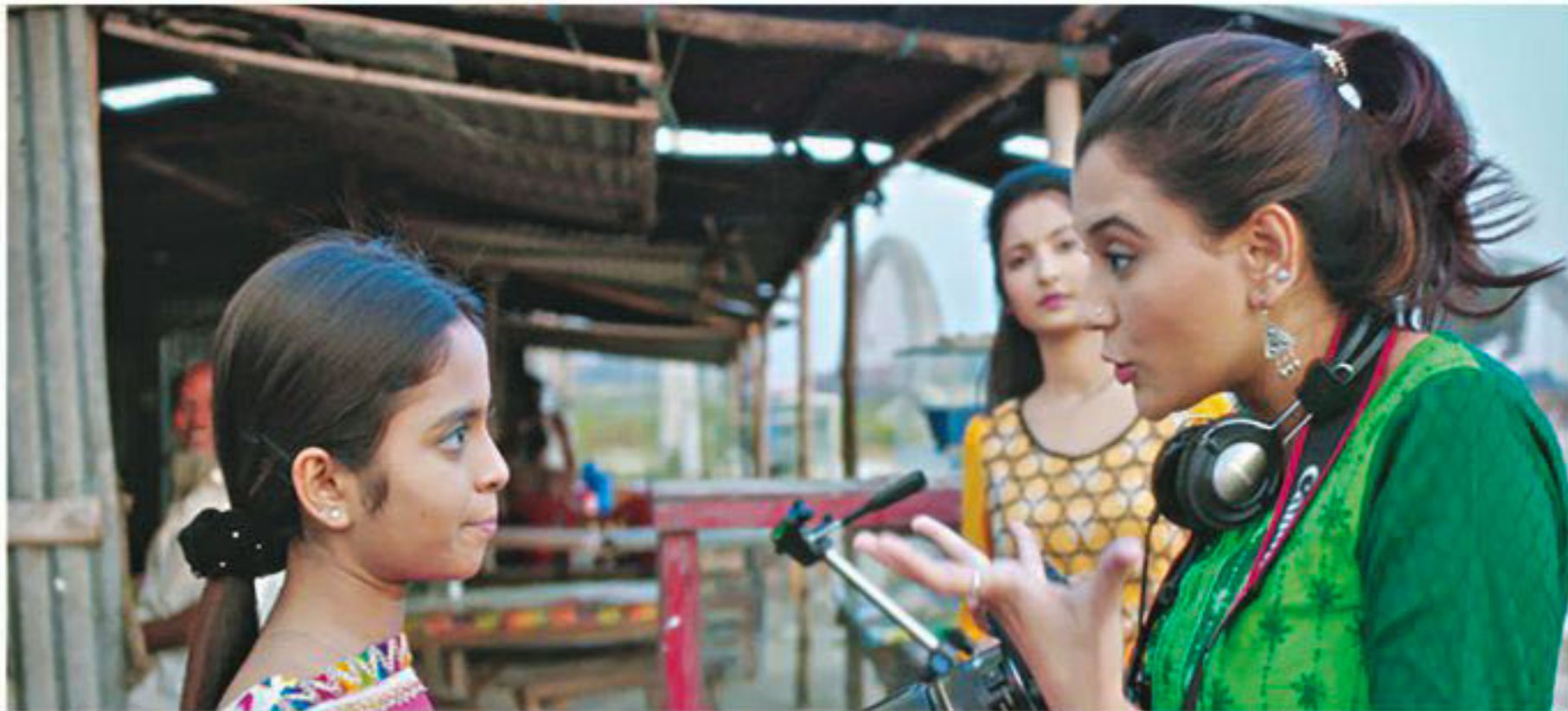
Amra Korbo Joy