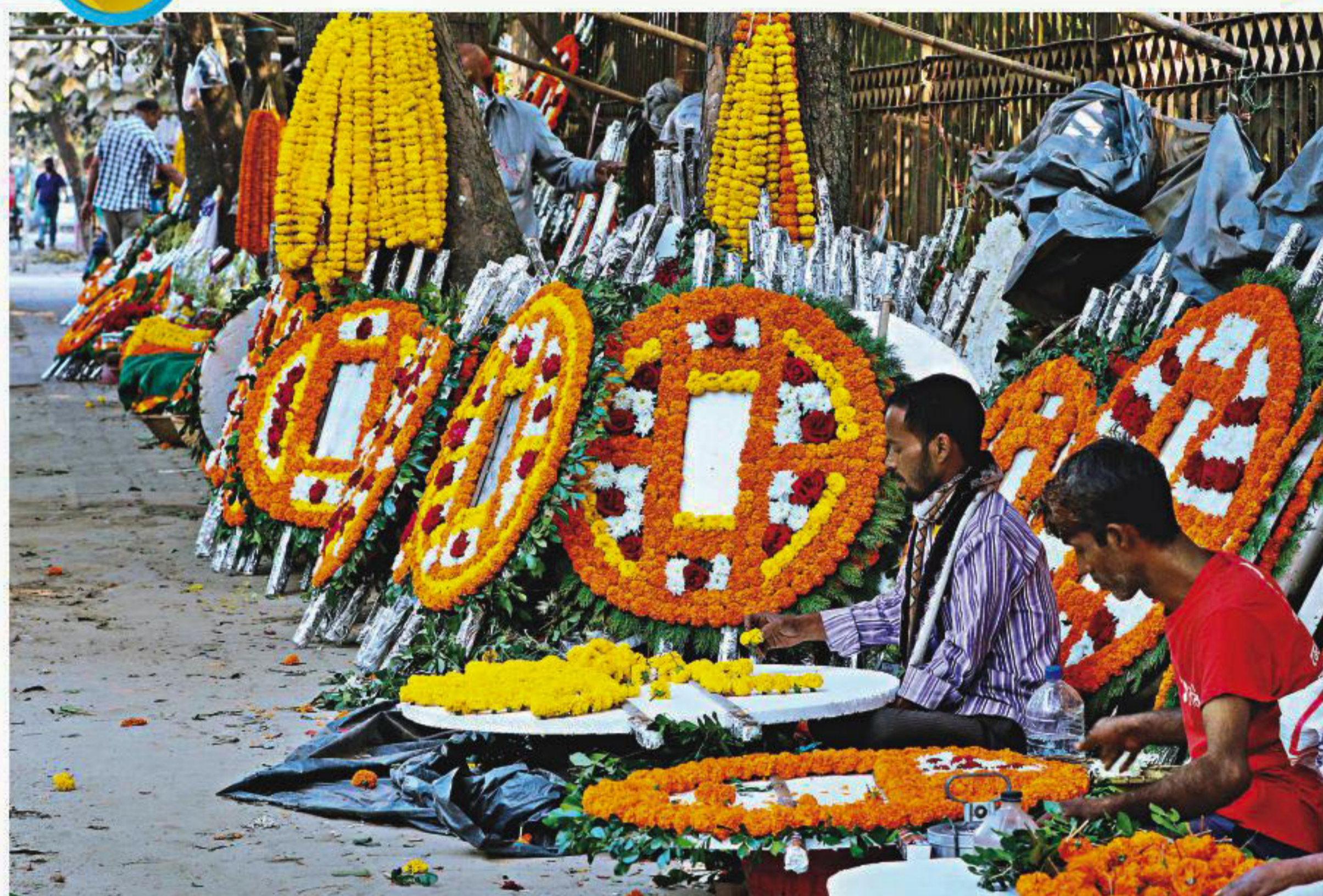
With the nation celebrating Victory Day today, florists had been busy making wreaths and completing orders on time. People from all strata of life will pay respects to martyrs of the Liberation War by placing these floral tributes at memorials across the country. This photo was taken in front of Curzon Hall yesterday.