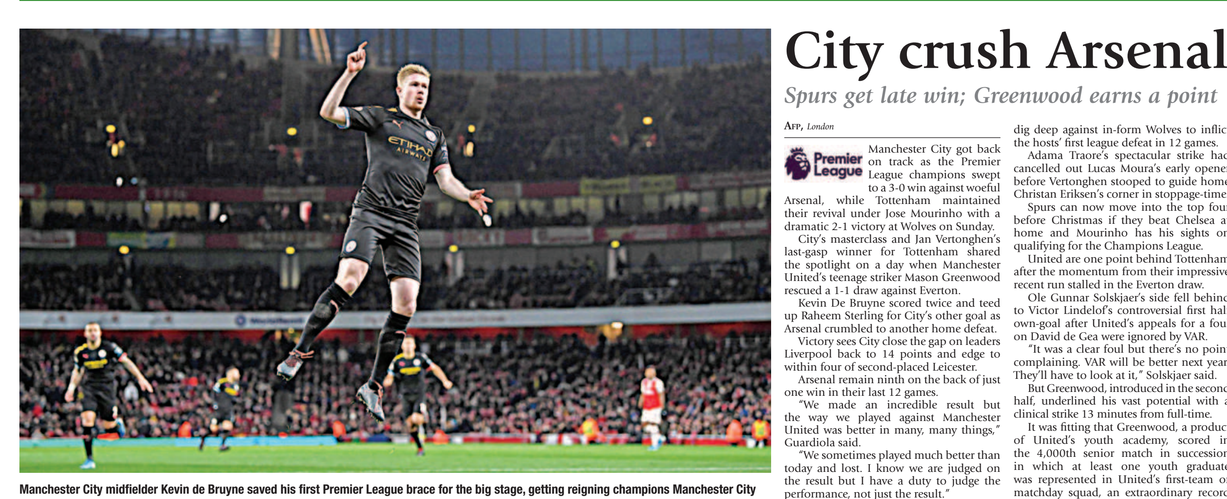
Manchester City midfielder Kevin de Bruyne saved his first Premier League brace for the big stage, getting reigning champions Manchester City back on track with two strikes in a 3-0 Premier League win against Arsenal at the Emirates Stadium yesterday.

clinical strike 13 minutes from full-time.