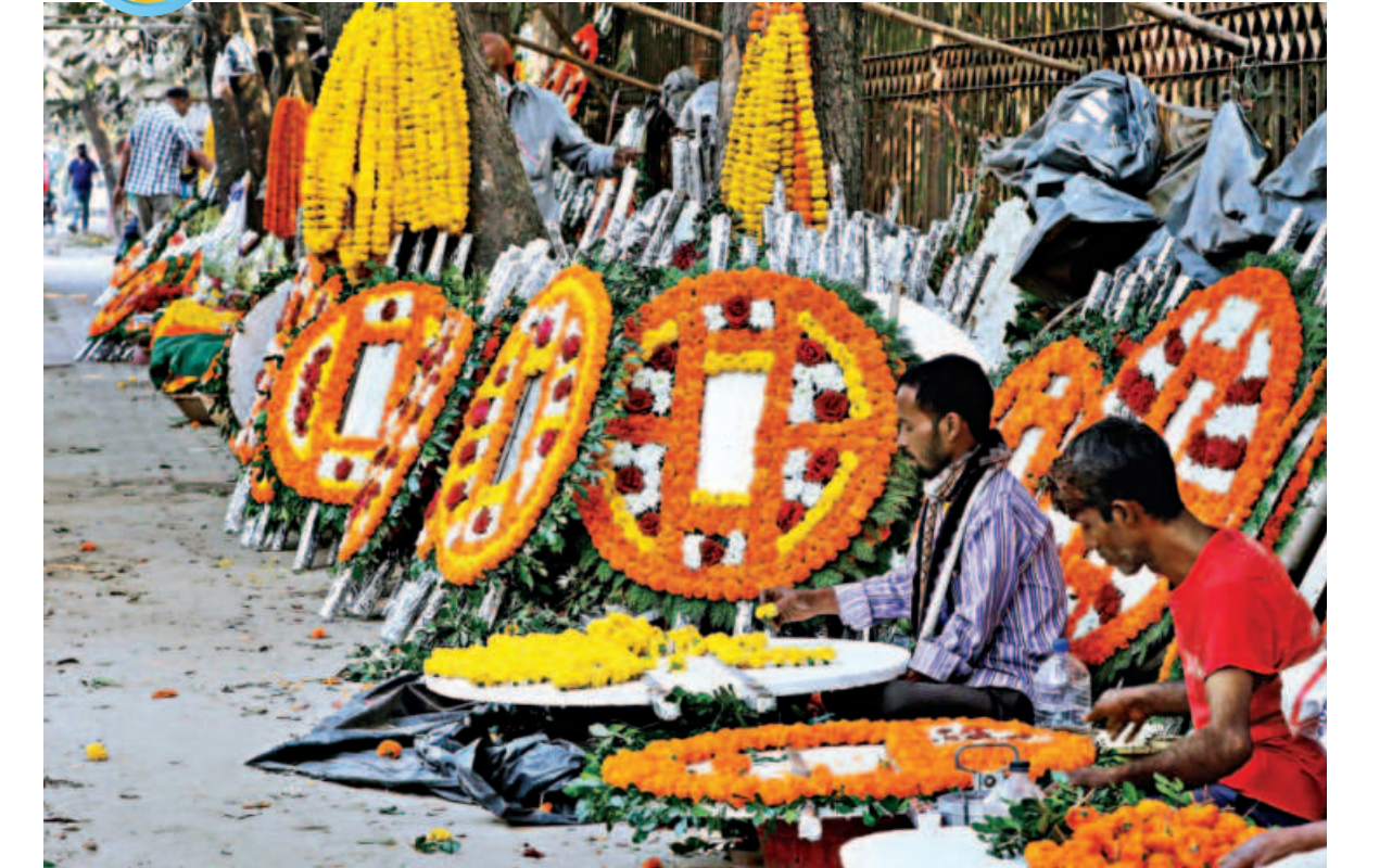
With the nation celebrating Victory Day today, florists had been busy making wreaths and completing orders on time. People from all strata of life will pay respects to martyrs of the Liberation War by placing these floral tributes at memorials across the country. This photo was taken in front of Curzon Hall yesterday.