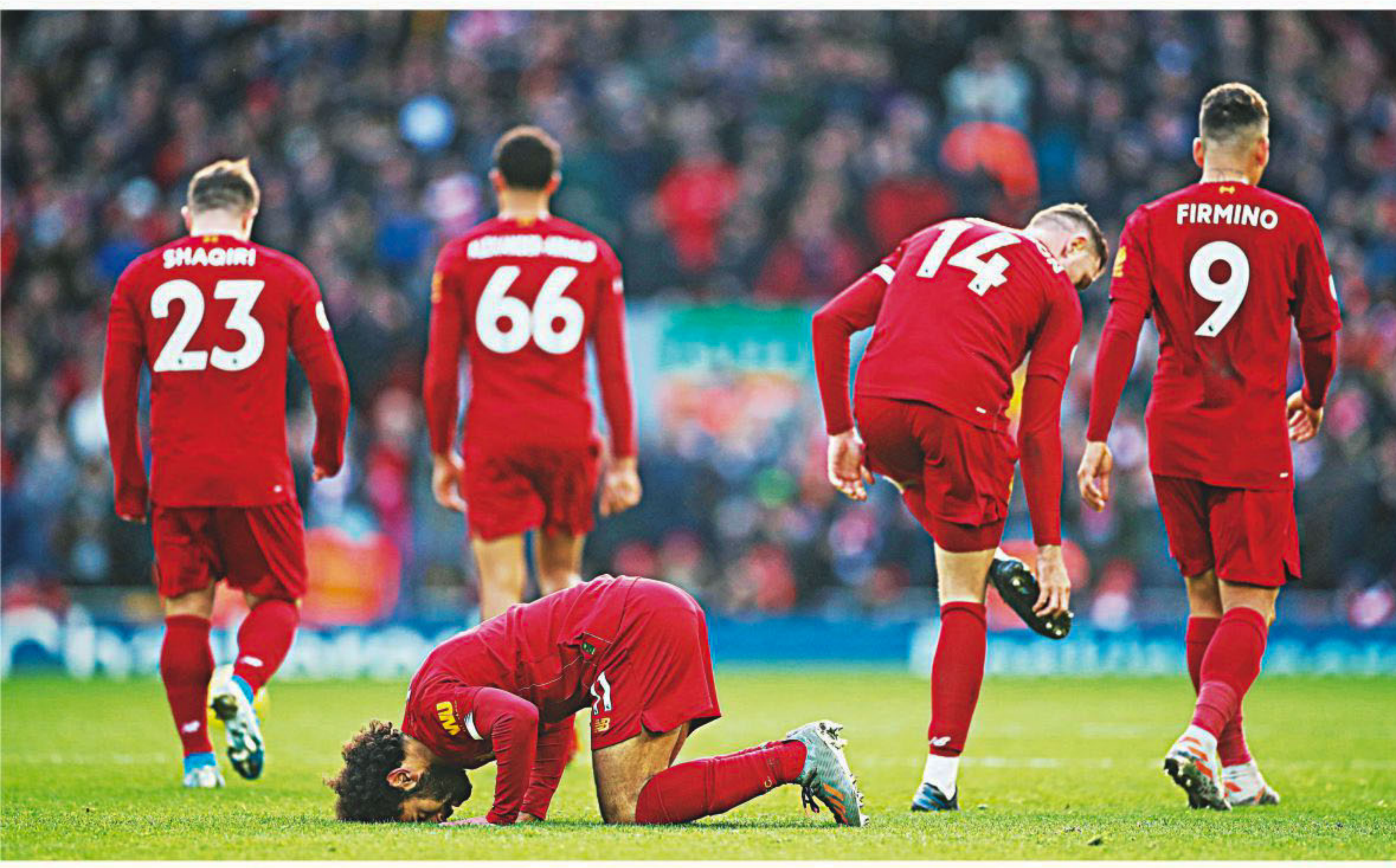
Liverpool forward Mohamed Salah celebrates his 38th minute goal against Watford in an English Premier League encounter at Anfield yesterday. Salah scored again in the 90th minute to ensure that his side go 11 points clear at the top of the table.

Live from 11:00pm Fiorentina v Inter Milan Live from 1:45am (Monday)