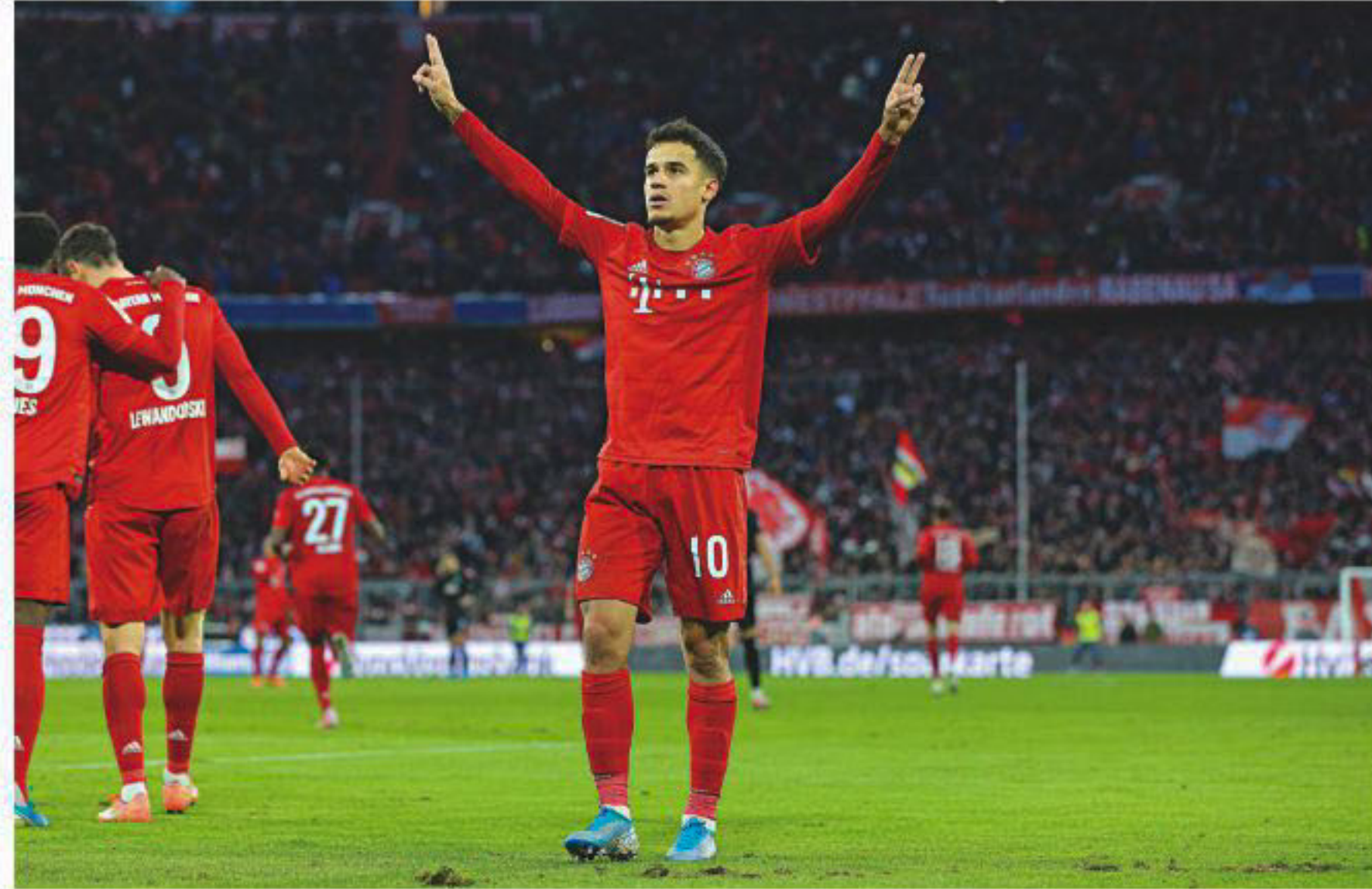
Bayern Munich midfielder Philippe Coutinho, on loan from Barcelona, scored a sublime hatrick and got two assists in a 6-1 demolition of Werder Bremen at the Allianz Arena in the Bundesliga yesterday

The meeting discussed two other matters: reinstating the rule of allowing one councillor to contest in the polls and that any BFF president aspirant must be in the executive committee at least once before contesting the post.