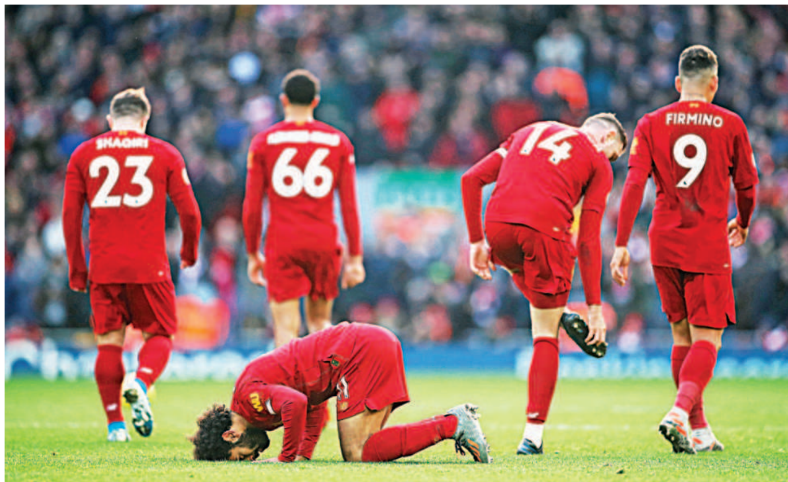
Liverpool forward Mohamed Salah celebrates his 38th minute goal against Watford in an English Premier League encounter at Anfield yesterday. Salah scored again in the 90th minute to ensure that his side go 11 points clear at the top of the table.

Live from 11:00pm Fiorentina v Inter Milan Live from 1:45am (Monday)