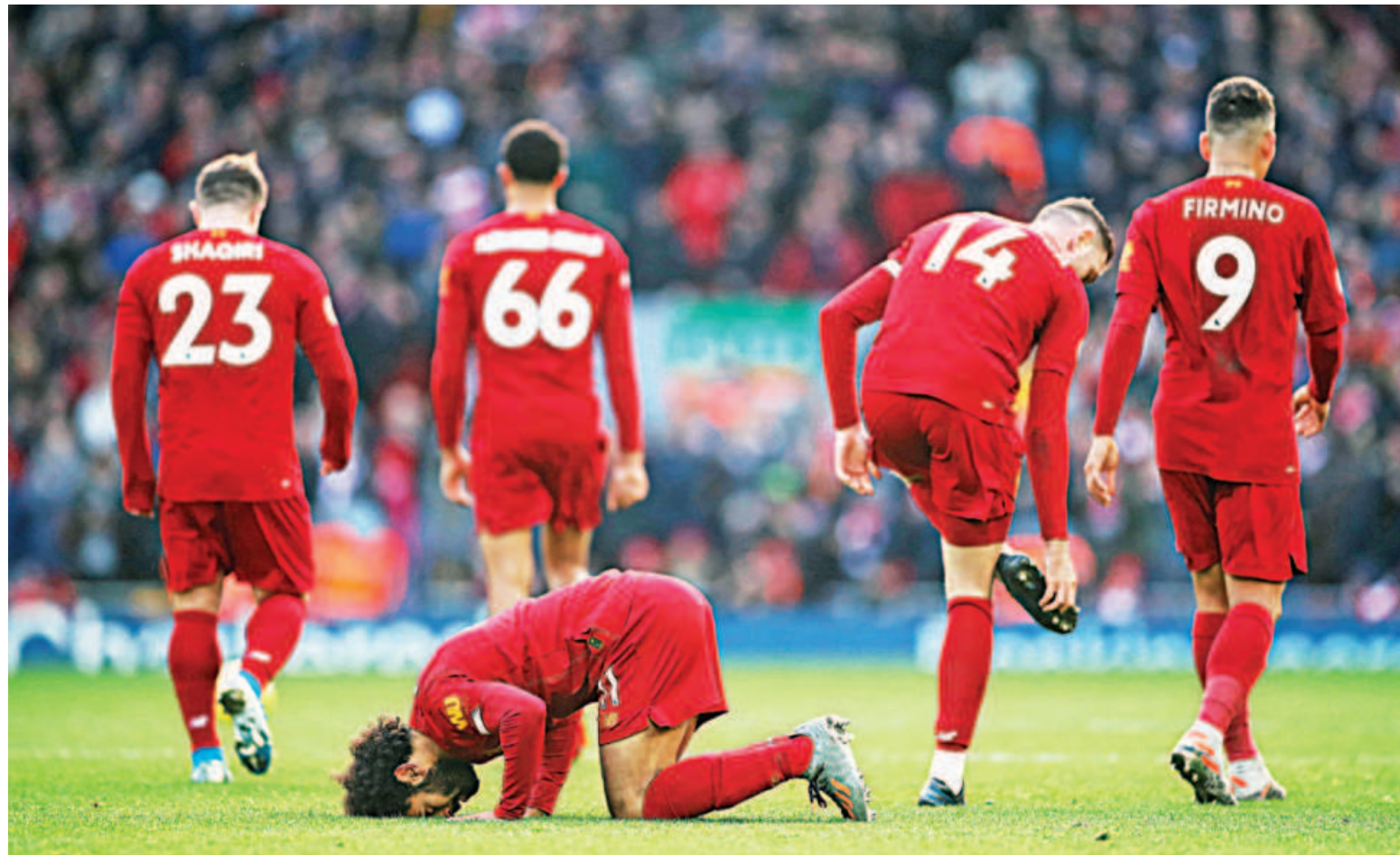
Liverpool forward Mohamed Salah celebrates his 38th minute goal against Watford in an English Premier League encounter at Anfield yesterday. Salah scored again in the 90th minute to ensure that his side go 11 points clear at the top of the table.

Live from 11:00pm Fiorentina v Inter Milan Live from 1:45am (Monday)