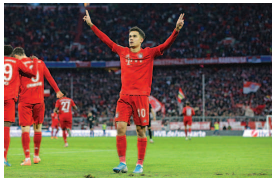
Bayern Munich midfielder Philippe Coutinho, on loan from Barcelona, scored a sublime hat-trick and got two assists in a 6-1 demolition of Werder Bremen at the Allianz Arena in the Bundesliga yesterday

The meeting discussed two other matters: reinstating the rule of allowing one councillor to contest in the polls and that any BFF president aspirant must be in the executive committee once before contesting the post.