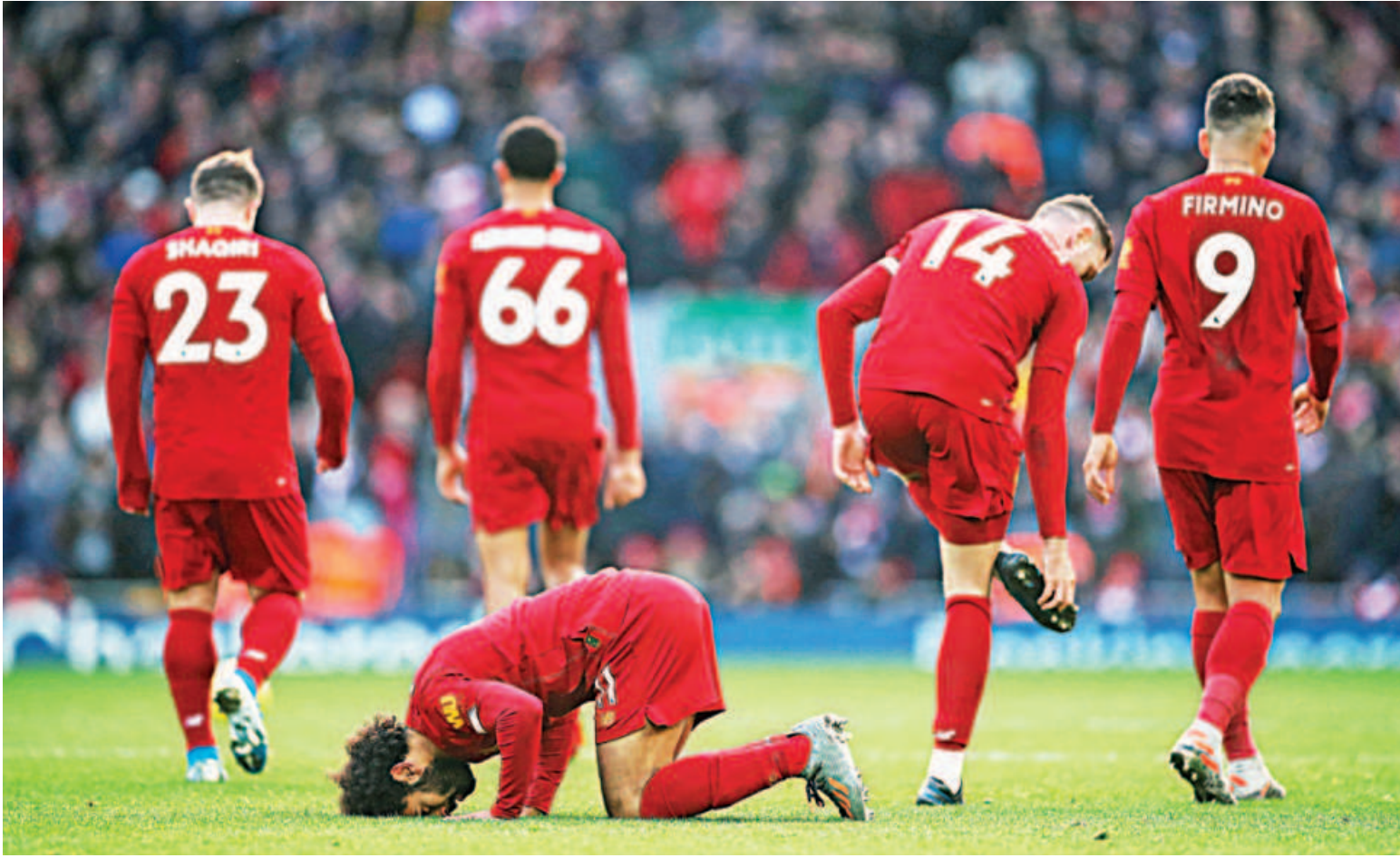
Liverpool forward Mohamed Salah celebrates his 38th minute goal against Watford in an English Premier League encounter at Anfield yesterday. Salah scored again in the 90th minute to ensure that his side go 11 points clear at the top of the table.

Live from 11:00pm Fiorentina v Inter Milan Live from 1:45am (Monday)