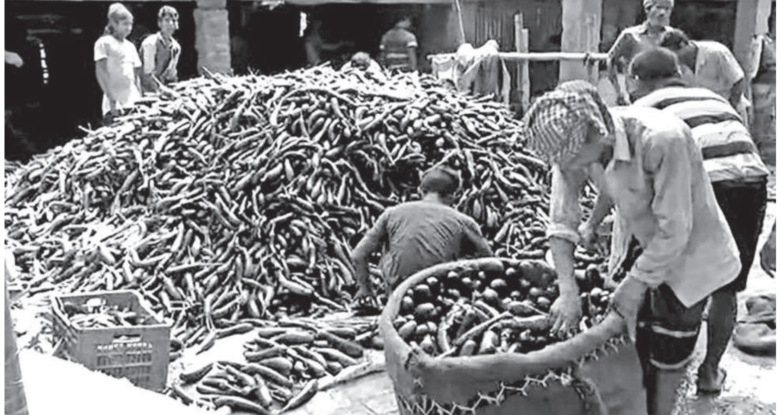
Growers remain busy packing brinjal in Math Shoildubi area of Faridpur's Sadarpur upazila.