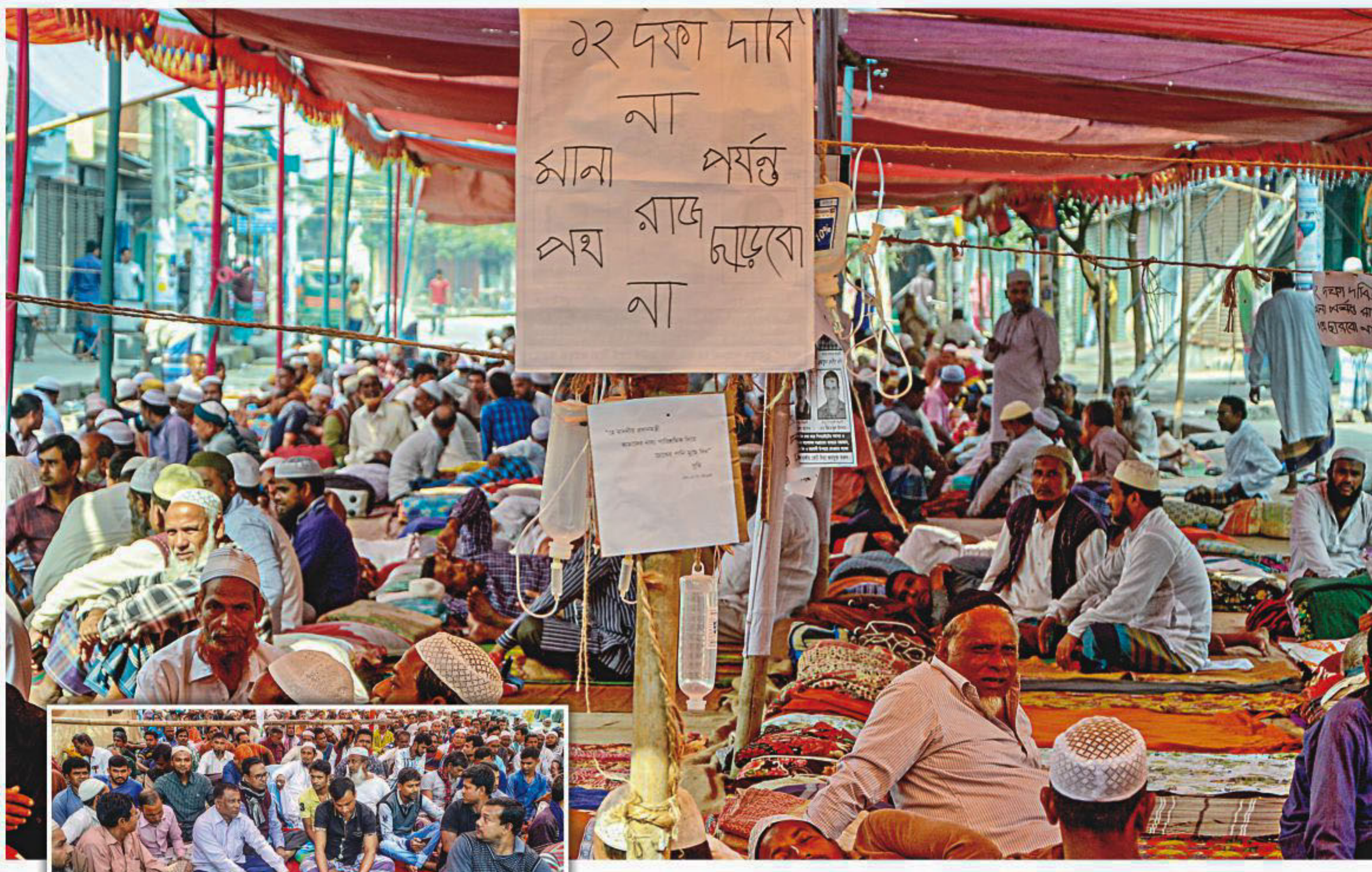
Workers of nine state-run jute mills in Khulna and Jashore industrial belt observing an indefinite hunger strike for the fourth consecutive day yesterday. They are staging the protest to press home their 11-point demand. The photos were taken outside Platinum Jute Mills in Khulna's Khalishpur area.