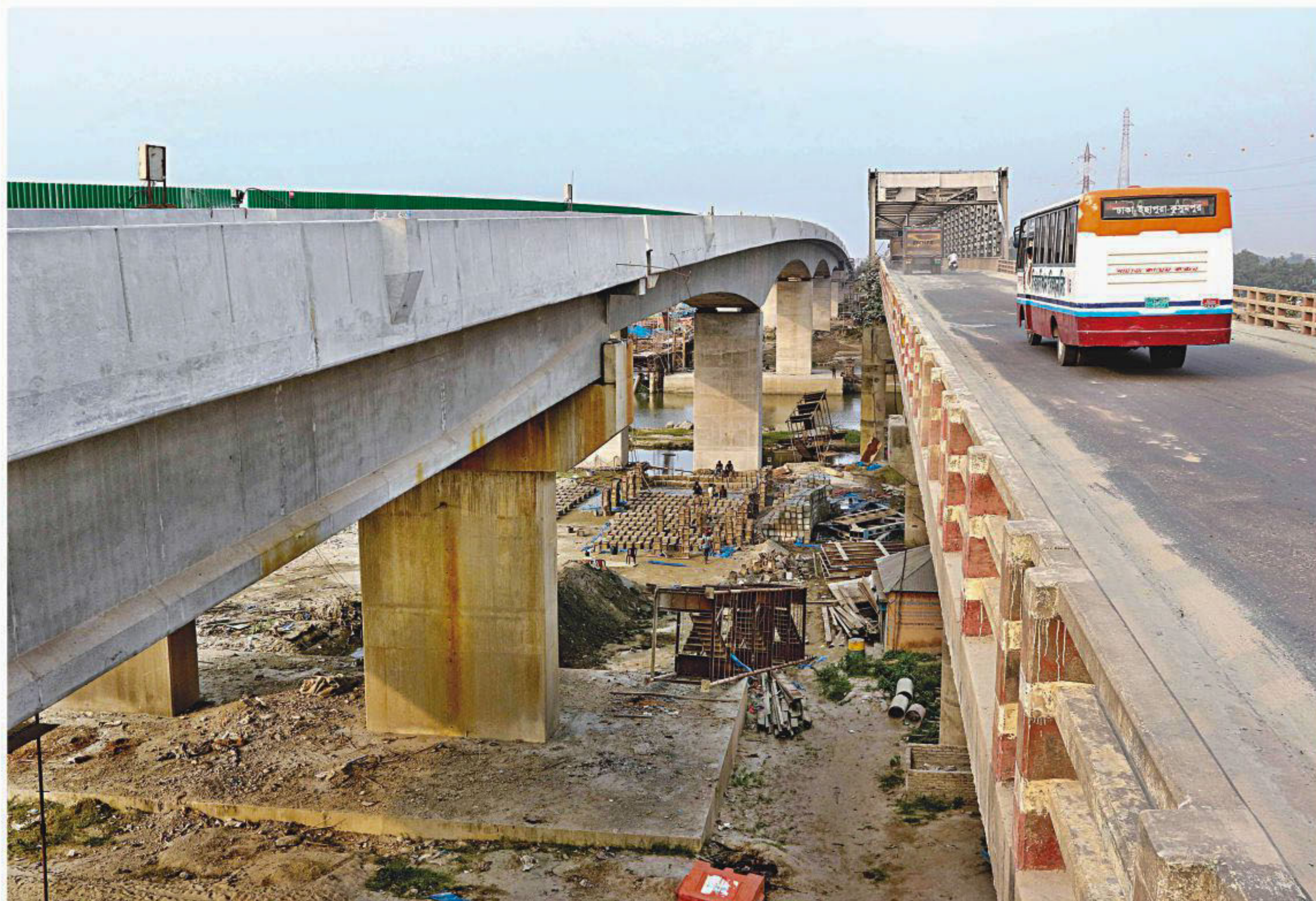
A new bridge is being built alongside the existing Dhaleshwari bridge on Dhaka-Mawa highway in Munshiganj. The new bridge, likely to be opened in June next year, will facilitate smooth flow of traffic on the highway after the inauguration of Padma bridge. The photo was taken recently.