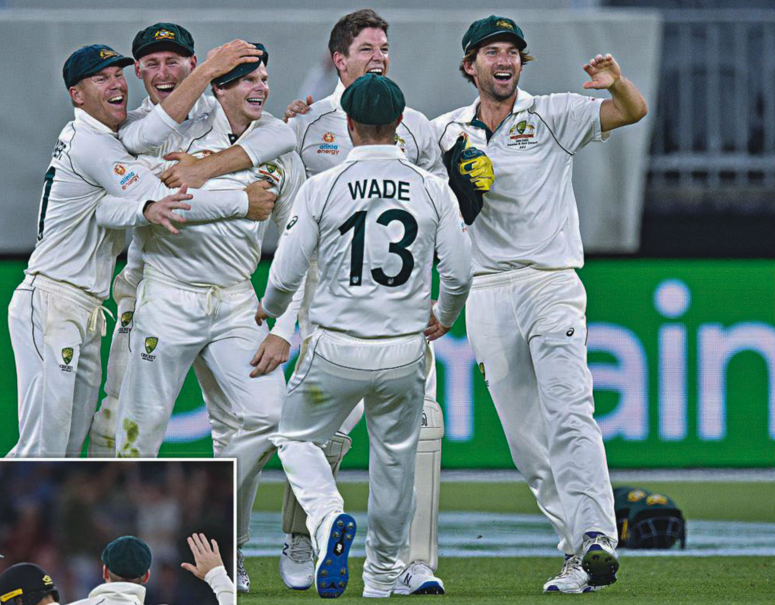
Australia's Steven Smith (3rd from L) is mobbed by teammates after completing a sensational catch to dismiss New Zealand skipper Kane Williamson on the second day of the first Test in Perth yesterday. However, it was (inset) Mitchell Starc who proved pivotal, tearing through the Kiwi innings with four wickets.

Time: 1:30pm Dhaka v Sylhet Time: 7:00pm