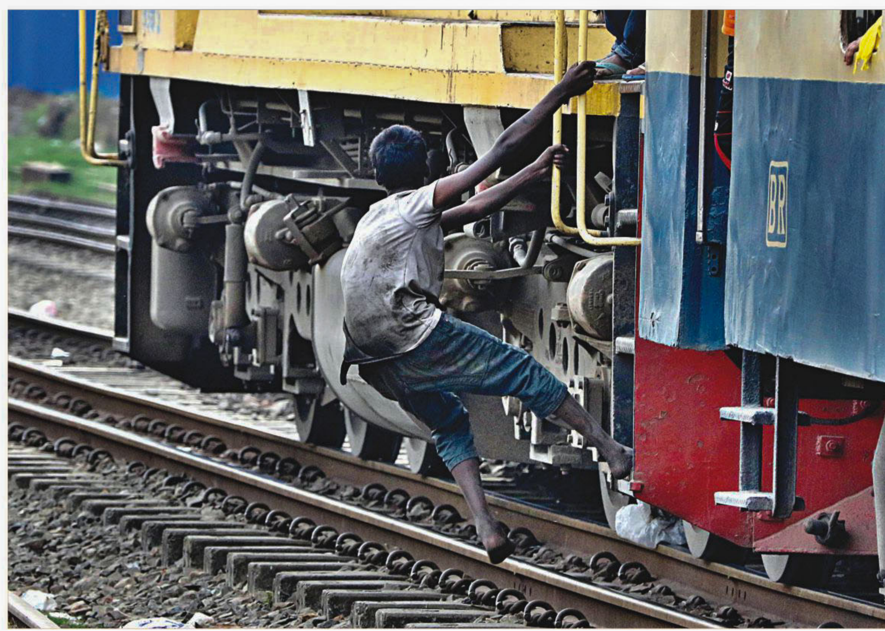
A boy dangles from the step of a train engine, putting his life at risk. Showing such blatant disregard for safety often leads to accidents. The photo was taken near Tejgaon Railway Station in the capital recently.

Sensing imminent defeat, the Pakistan army... SEE PAGE 2 COL 1 SEE OUR SPECIAL SUPPLEMENT