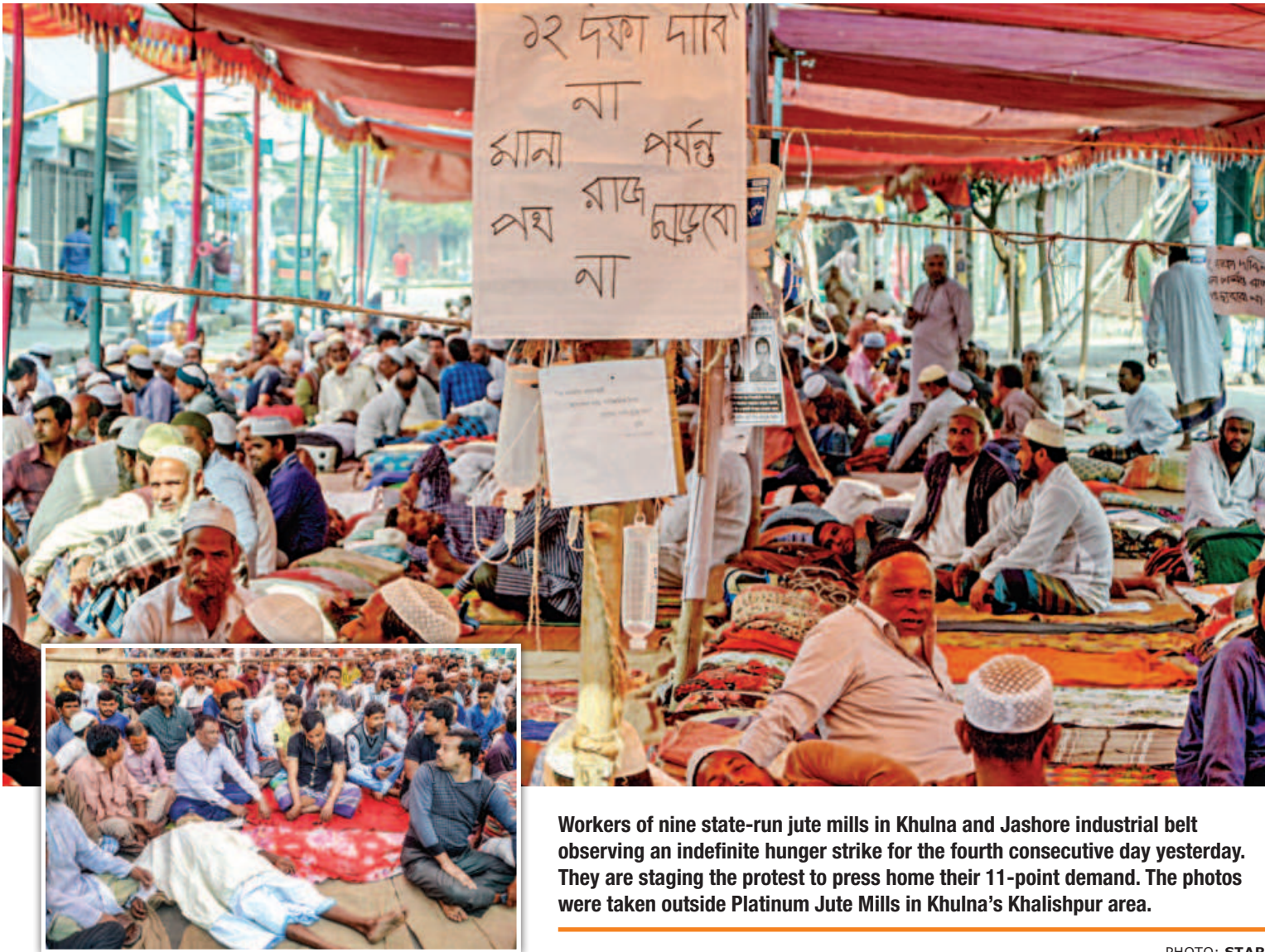
Workers of nine state-run jute mills in Khulna and Jashore industrial belt observing an indefinite hunger strike for the fourth consecutive day yesterday. They are staging the protest to press home their 11-point demand. The photos were taken outside Platinum Jute Mills in Khulna's Khalishpur area.

If you want to buy skin-whitening cream online, especially those advertised to have been imported, think twice. Because a new global study has found presence of high level of poisonous mercury in the cream, posing a risk to human health. The study, titled “Dangerous, Mercury-lead and Often Illegal Skin Lightening Products: Readily Available for Online Purchase,” tested 16 samples of imported skin-whitening creams at two international labs and found all of those had high mercury level than the permissible level set by the Bangladesh Standards and Testing Institution (BSTI). All the 16 products had mercury levels ranging from 49 parts per million (ppm) to 129,433 ppm, much higher than the permissible level set by the BSTI, the report says. In 2015, the BSTI set a standard for skin cream allowing a maximum 1ppm of mercury concentration. Zero Mercury Working Group (ZMWG), an international coalition of more than 110 environmental and health NGOs from over 55 countries, conducted the study in October. Environment and Social Development Organisation (ESDO), a Bangladeshi organisation, revealed the study SEE PAGE 10 COL 2