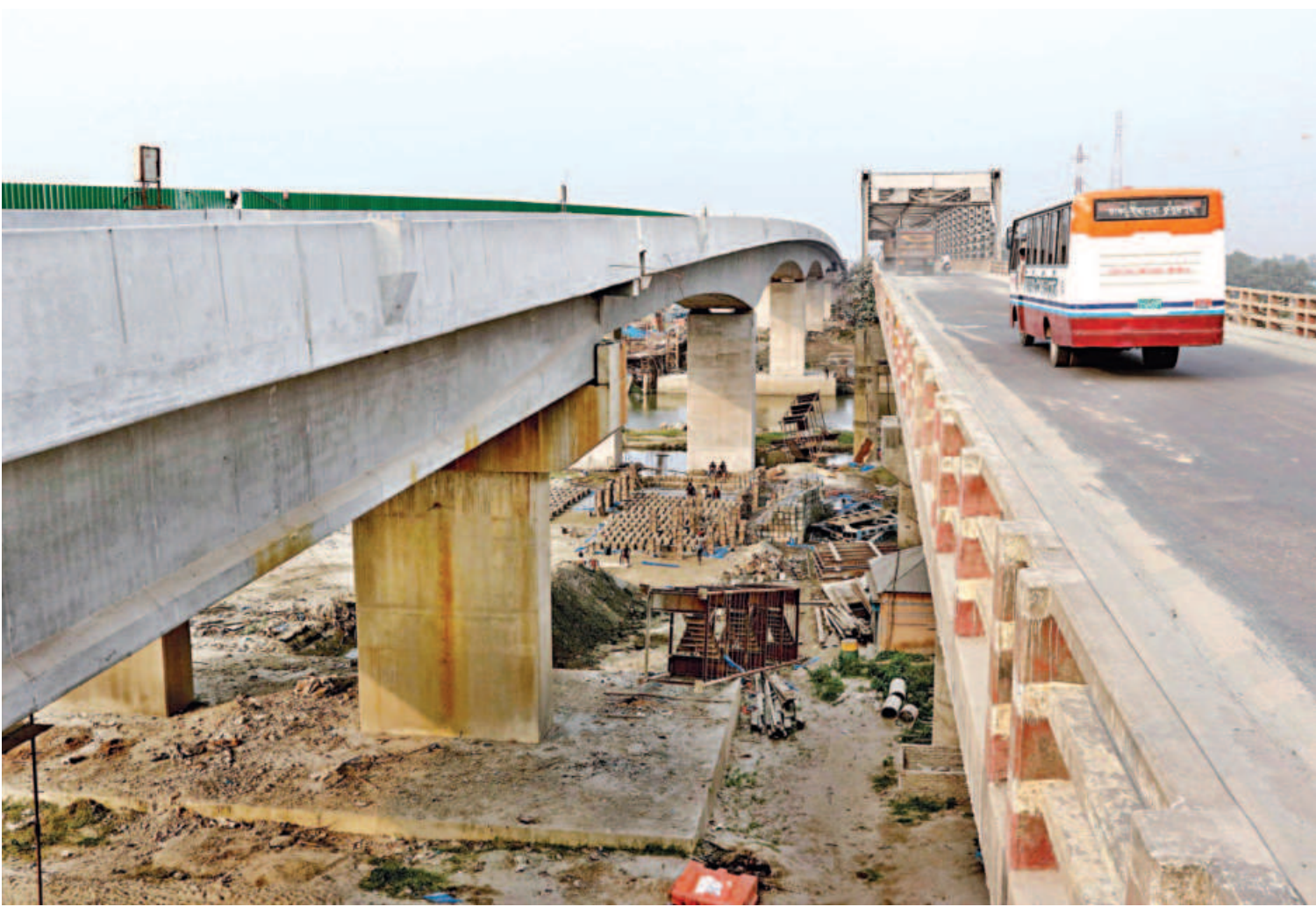
A new bridge is being built alongside the existing Dhaleshwari bridge on Dhaka-Mawa highway in Munshiganj. The new bridge, likely to be opened in June next year, will facilitate smooth flow of traffic on the highway after the inauguration of Padma bridge. The photo was taken recently.