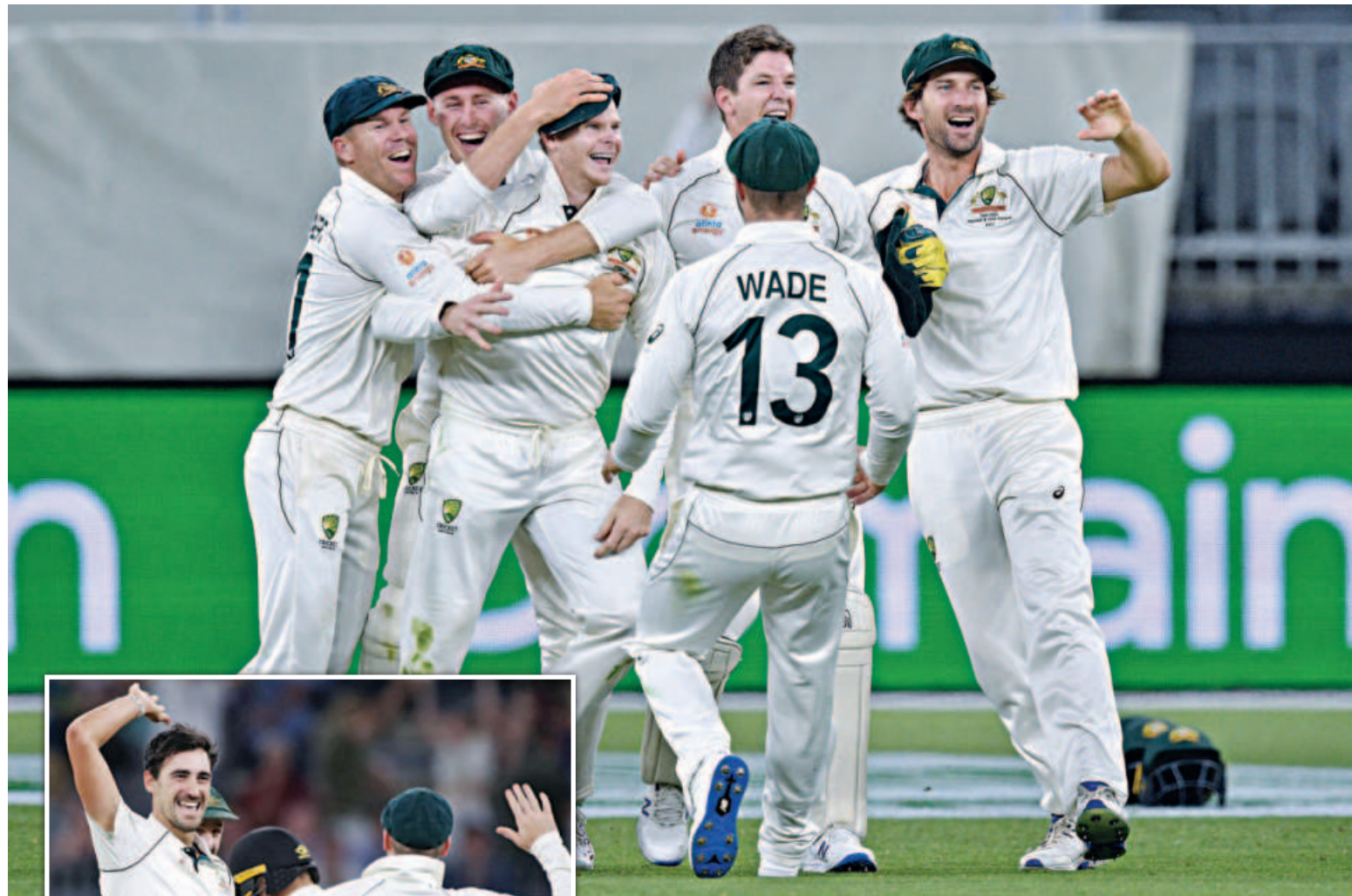
Australia's Steven Smith (3rd from L) is mobbed by teammates after completing a sensational catch to send New Zealand's Kane Williamson back to the dressing room on 34 on the second day of the first Test in Perth yesterday. However, it was (Inset) Mitchell Starc who proved pivotal, tearing through the Kiwi innings with four wickets.

Bangabandhu Bangladesh Premier League Venue: Sher-e-Bangla National Stadium Rangpur v Chattogram Time: 1:30pm Dhaka v Sylhet Time: 7:00pm