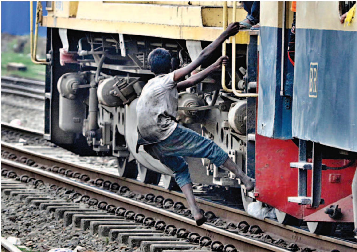
A boy dangles from the step of a train engine, putting his life at risk. Showing such blatant disregard for safety often leads to accidents. The photo was taken near Tejgaon Railway Station in the capital recently.