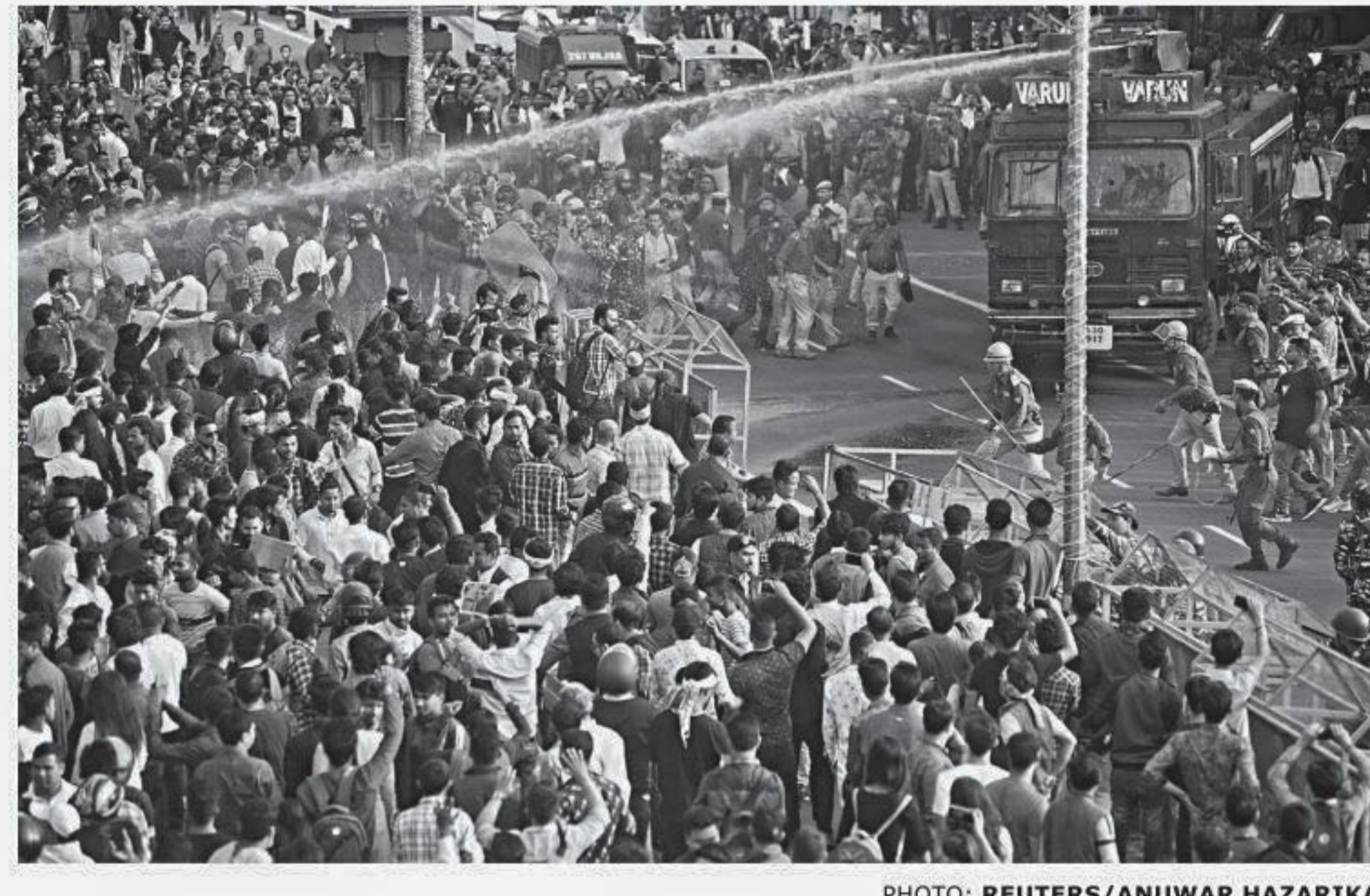
Police use water cannon to disperse demonstrators during a protest against Citizenship Amendment Bill (CAB), which seeks to give citizenship to religious minorities persecuted in neighbouring Muslim countries, in Guwahati, India, on December 11, 2019.

While we cannot comment on whether the xenophobic fears of the north-eastern states are rational, what is apparent is that the CAB might potentially increase religio-ethnic tensions in the northeast of the country.