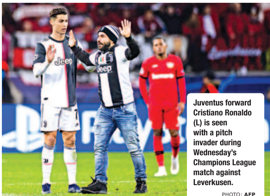
Juventus forward Cristiano Ronaldo (L) is seen with a pitch invader during Wednesday's Champions League match against Leverkusen.