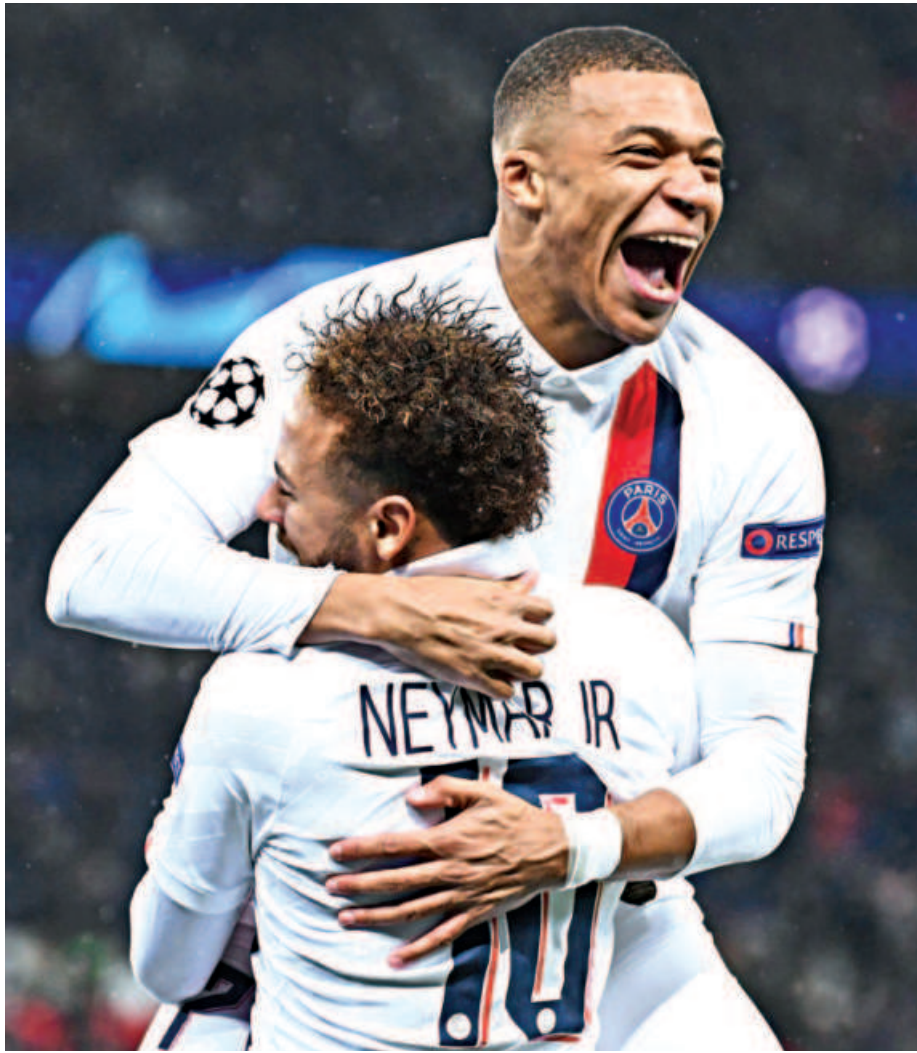
PSG superstars Neymar and Kylian Mbappe both got on the scoresheet of a 5-0 win against Galatasaray at the Parc des Princes on Wednesday, making the Brazilian's return to the Champions League a memorable one.