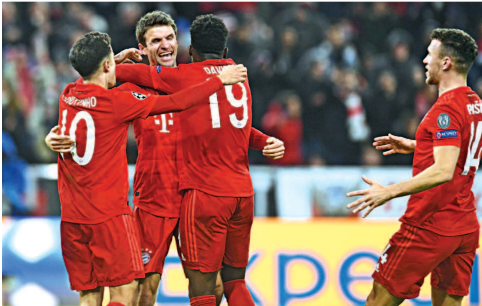
Bayern Munich's Thomas Muller (2nd from L) celebrates with teammates after scoring in the 45th minute of a 3-1 win over Tottenham in a UEFA Champions League encounter at the Allianz Arena on Wednesday.

Bangabandhu Bangladesh Premier League Venue: Sher-e-Bangla National Stadium, Dhaka Sylhet v Rajshahi Time: 2:00pm Dhaka v Cumilla Time: 7:00pm