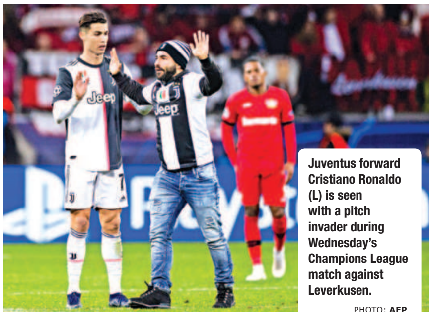
Juventus forward Cristiano Ronaldo (L) is seen with a pitch invader during Wednesday's Champions League match against Leverkusen.