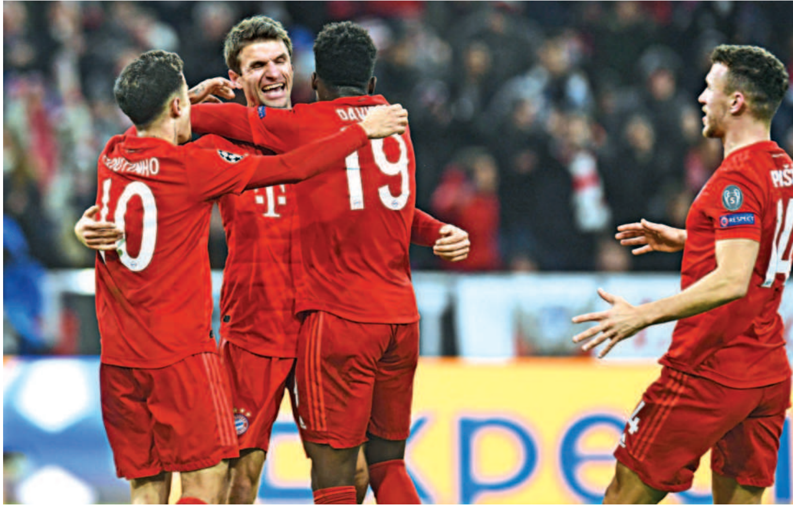
Bayern Munich's Thomas Muller (2nd from L) celebrates with teammates after scoring in the 45th minute of a 3-1 win over Tottenham in a UEFA Champions League encounter at the Allianz Arena on Wednesday.

Bangabandhu Bangladesh Premier League Venue: Sher-e-Bangla National Stadium, Dhaka Sylhet v Rajshahi Time: 2:00pm Dhaka v Cumilla Time: 7:00pm