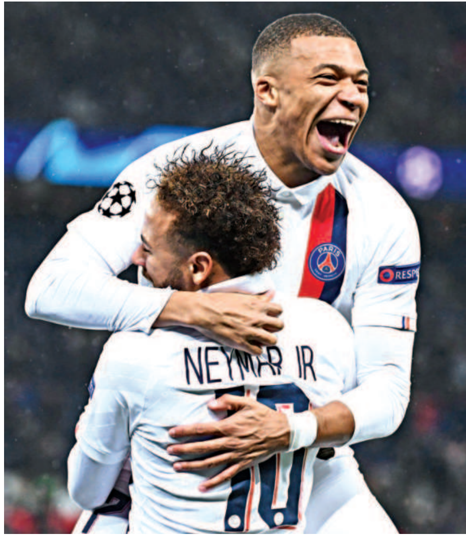
PSG superstars Neymar and Kylian Mbappe both got on the scoresheet of a 5-0 win against Galatasaray at the Parc des Princes on Wednesday, making the Brazilian's return to the Champions League a memorable one.